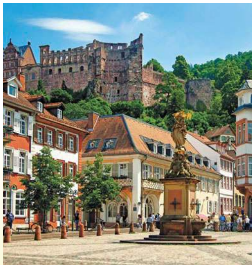
Heidelberg Castle above the historic old town