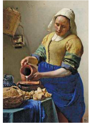
Detail of "The Milkmaid," Johannes Vermeer, Rijksmuseum