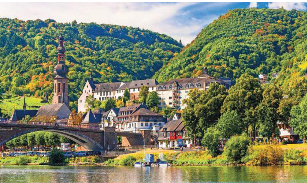
Cochem & Reichsburg Castle on the Moselle River

• A Musical Walk in Time. On a guided walk, see Rudesheim's medieval walls and its main street, and then tour a delightful museum with self-playing musical instruments.