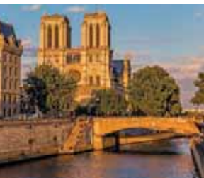
Notre Dame, Paris