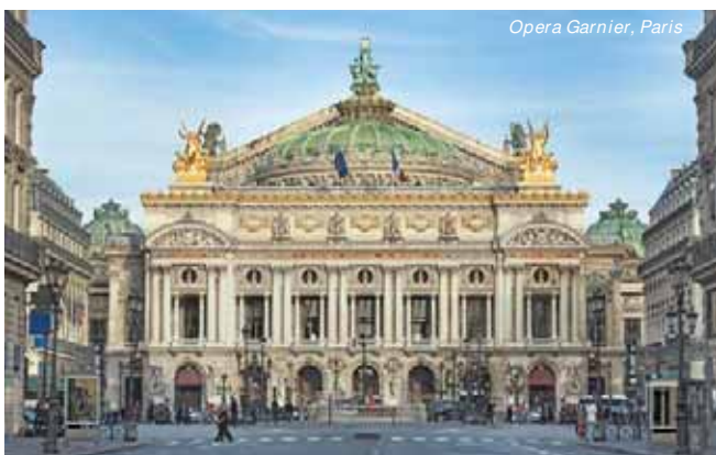
Opera Garnier, Paris