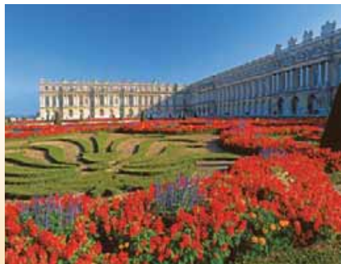
Gardens at Versailles