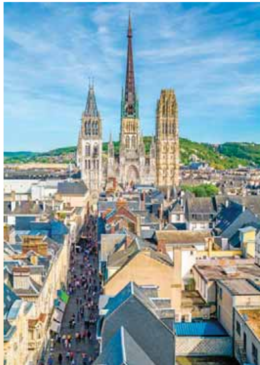
Notre-Dame de Rouen