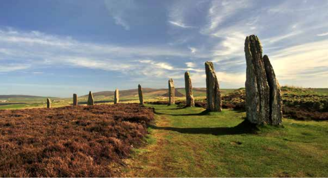
Ring of Brodgar