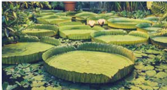
Giant Water Lilies—Oslo Botanical Garden, Norway

Further details and pricing will be sent to confirmed participants.