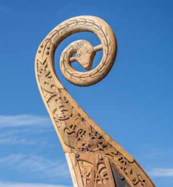
Viking Ship Wood Carving

including puffins, followed by a visit to beautiful Ålesund. Known for its Art Nouveau buildings and islands stretching out into the ocean, Ålesund offers three optional excursions including: 1) the medieval village of Sunnmøre, an open-air museum; 2) Viking's Island; or 3) an in-depth city walk including Mt. Aksla, followed by free time. In the afternoon, enjoy cruising with time for lectures. Spend the afternoon at sea, relaxing on board and keeping an eye out for whales.