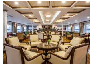
SUNDECK INDOOR LOUNGE