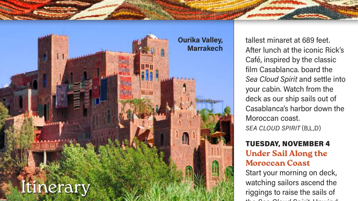
Ourika Valley, Marrakech