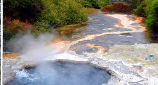
Geothermal pools in Rotorua.

nature, culture, and history of Southern New Zealand. HERITAGE ADVENTURER (B,L,D)