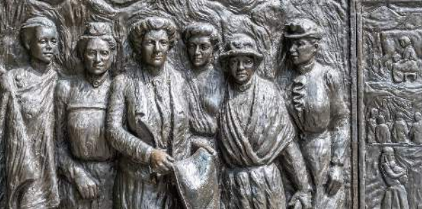
Kate Sheppard Memorial in Christchurch.