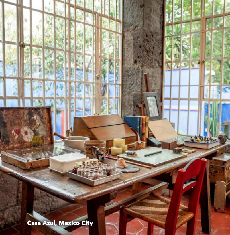
Casa Azul, Mexico City