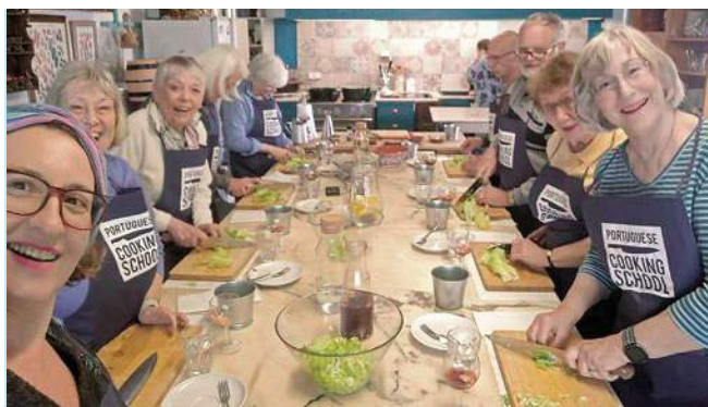
Cooking at Sofia's farmhouse near Évora