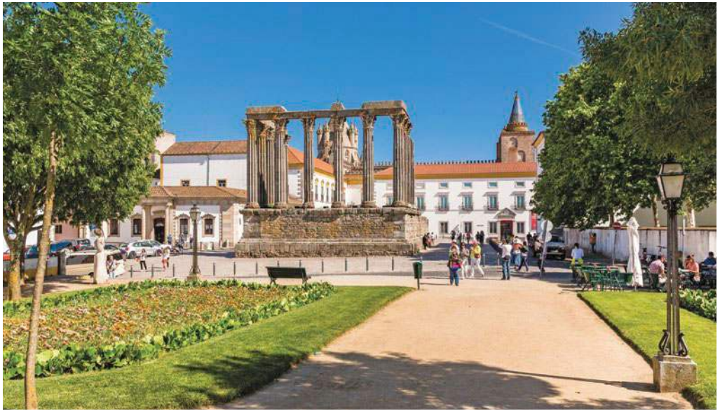
Temple of Diana, Évora