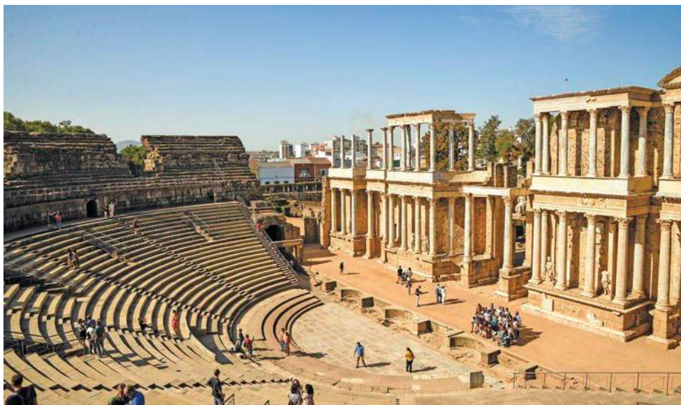
Amphitheater, Mérida, Spain