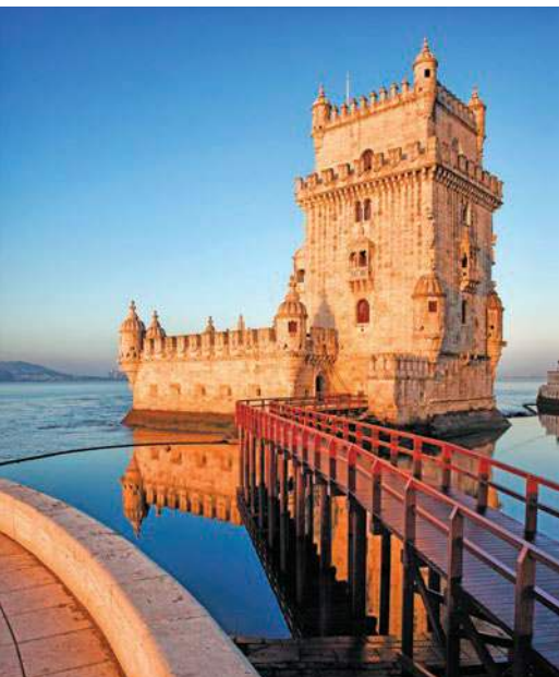
Tower of Belém, Lisbon