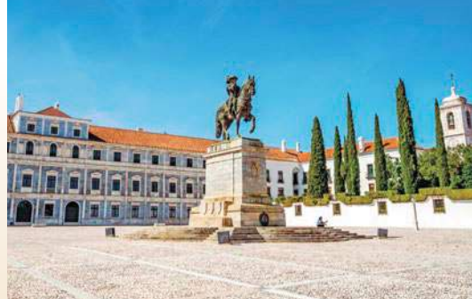
Ducal Palace, Vila Viçosa

Monsaraz. Take in the medieval atmosphere of this picturesque, hilltop village and sweeping countryside views during a guided stroll. Next, travel to Herdade do Esporão, a family-owned business on a large estate. Learn how their olive oil is made on a tour, take part in a unique