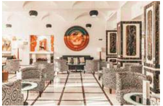
Alentejo Marmoris Hotel & Spa | Vila Viçosa