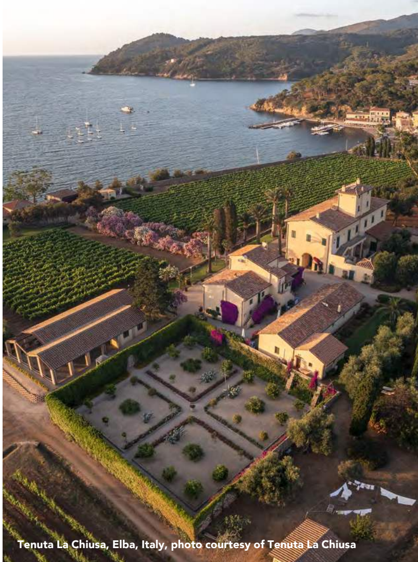
Tenuta La Chiusa, Elba, Italy

Step ashore on Elba , best known as Napoleon's island of exile from 1814 to 1815. From Elba's capital, Portoferraio , set forth on a scenic drive south to Villa San Martino , Napoleon's neoclassical residence. Inside, an expert will show you its Napoleonic relics, engravings, and the renowned statue of Galatea, sculpted by Antonio Canova.