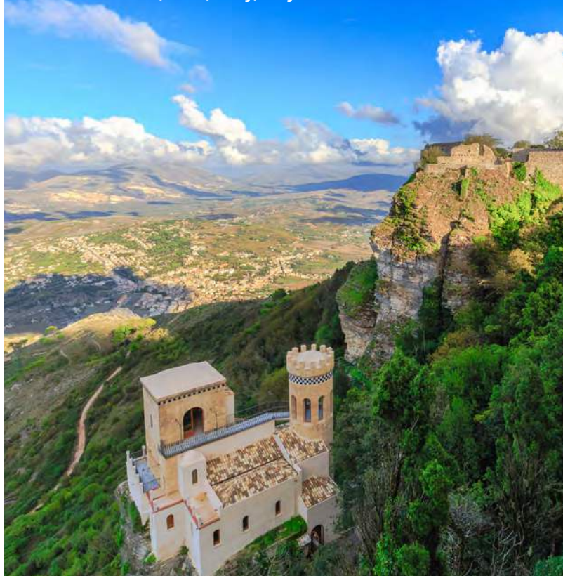
Castello di Venere, Erice, Sicily, Italy