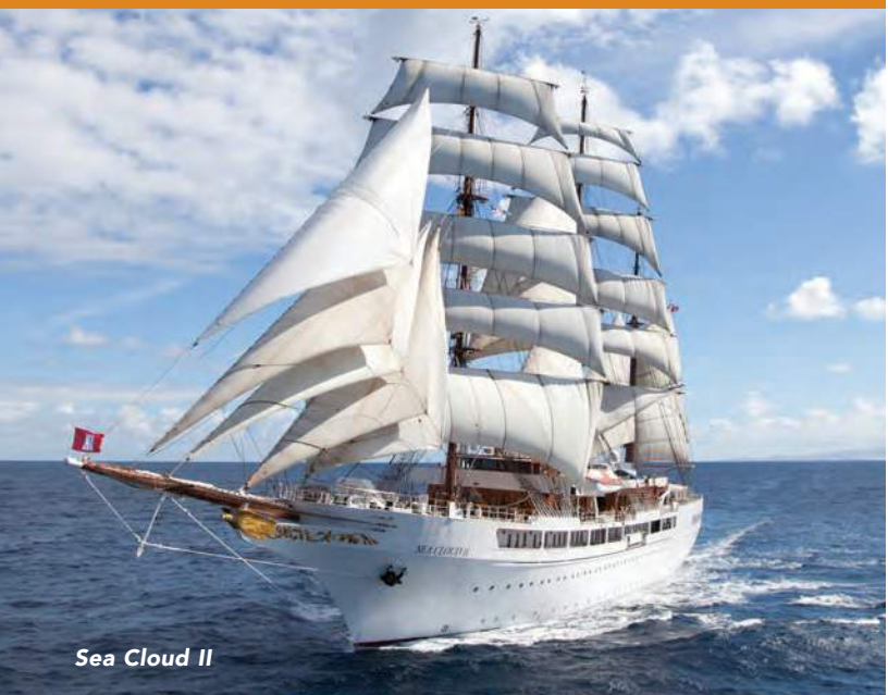
Sea Cloud II

Sea Cloud II is a three-masted sailing yacht steeped in the elegance of yesteryear and complemented with the most modern amenities. Sister ship of the legendary Sea Cloud , Sea Cloud II has 47 outside cabins and travels under 23 billowing sails trimmed by hand. From the mahogany-paneled library and gracious lounge to the gym and watersports platform, no detail has been overlooked. Praised by the world's most discerning travelers, Sea Cloud II receives consistently high rankings from Condé Nast Traveler . Passengers enjoy open seating at all meals and complimentary use of all water sports equipment. A doctor is on call 24 hours a day. Please note: There is no elevator on Sea Cloud II .