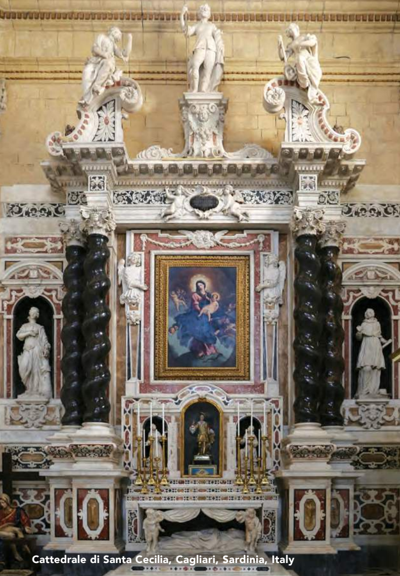
Cattedrale di Santa Cecilia, Cagliari, Sardinia, Italy