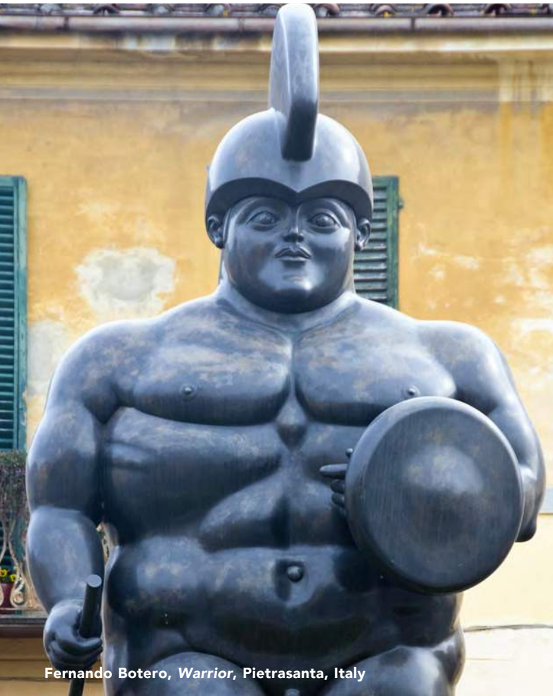
Fernando Botero, Warrior , Pietrasanta, Italy

Disembark Sea Cloud II this morning in Genoa and transfer to the airport for your flights home. B