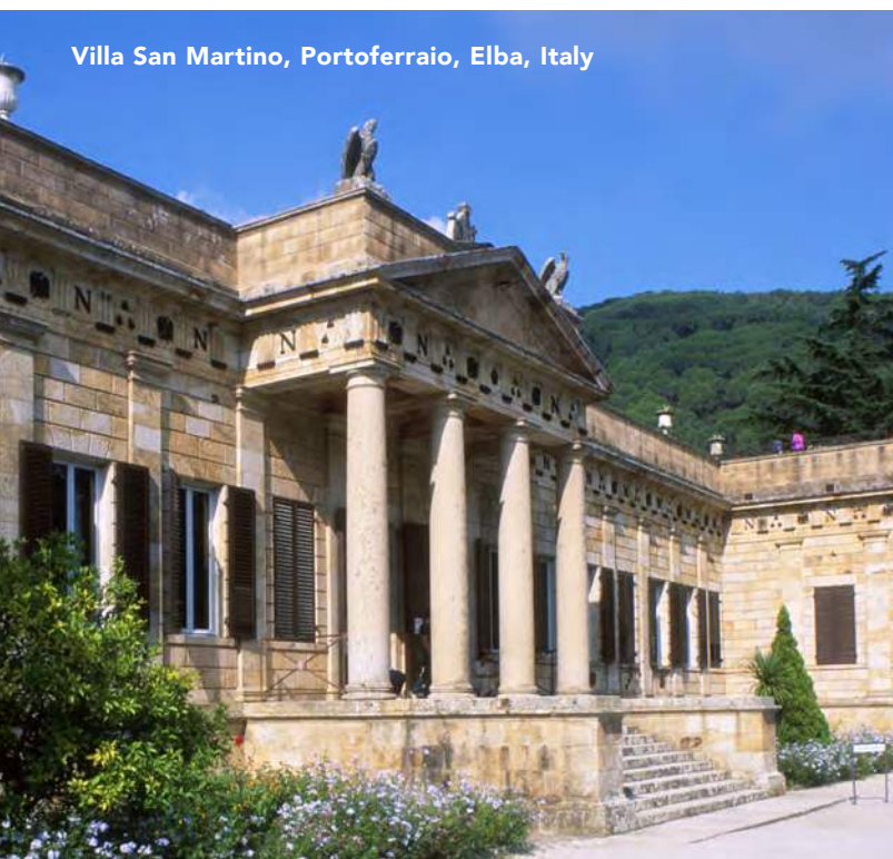
Villa San Martino, Portoferraio, Elba, Italy

Stop at the imposing Porte de Gênes , a 12th-century Genoese fortification that stood guard over Bonifacio's citadel for centuries. Return to Sea Cloud II for lunch and sail in the early evening northward to Elba. B,L,D