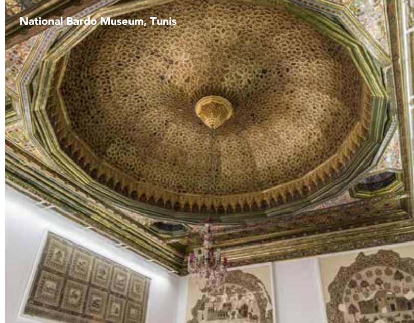
National Bardo Museum, Tunis

With an expert guide, traverse Kerkouane's streets and defensive walls laid out over 2,600 years ago, examining remarkably well-preserved ruins unearthed since the city's rediscovery in 1952, including the Mediterranean region's earliest known private baths .