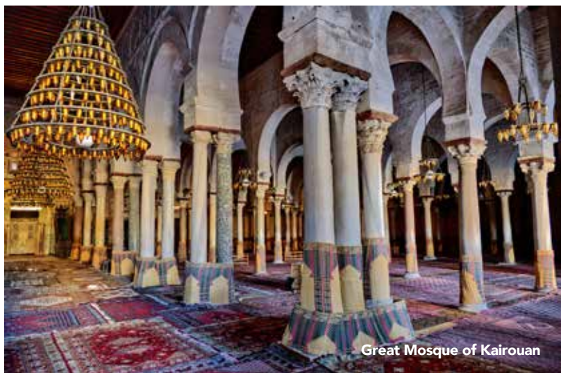
Great Mosque of Kairouan

After enjoying a lunch of local Tunisian cuisine, visit the El Jem Museum , renowned for its extensive collection of Roman mosaics, sculptures, pottery, and jewelry. A standout exhibit is the African House , a meticulously restored Roman villa featuring its original mosaics.