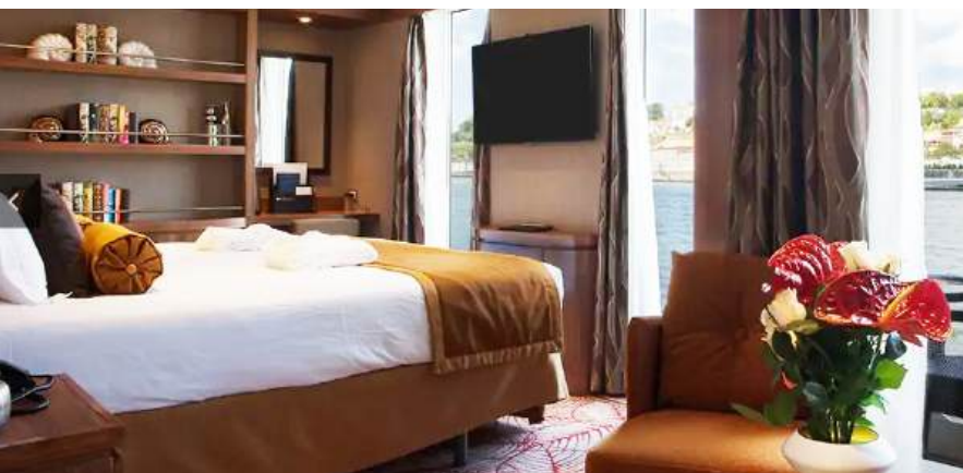
AmaSintra (top), Panoramic Lounge (center), and Suite (above)