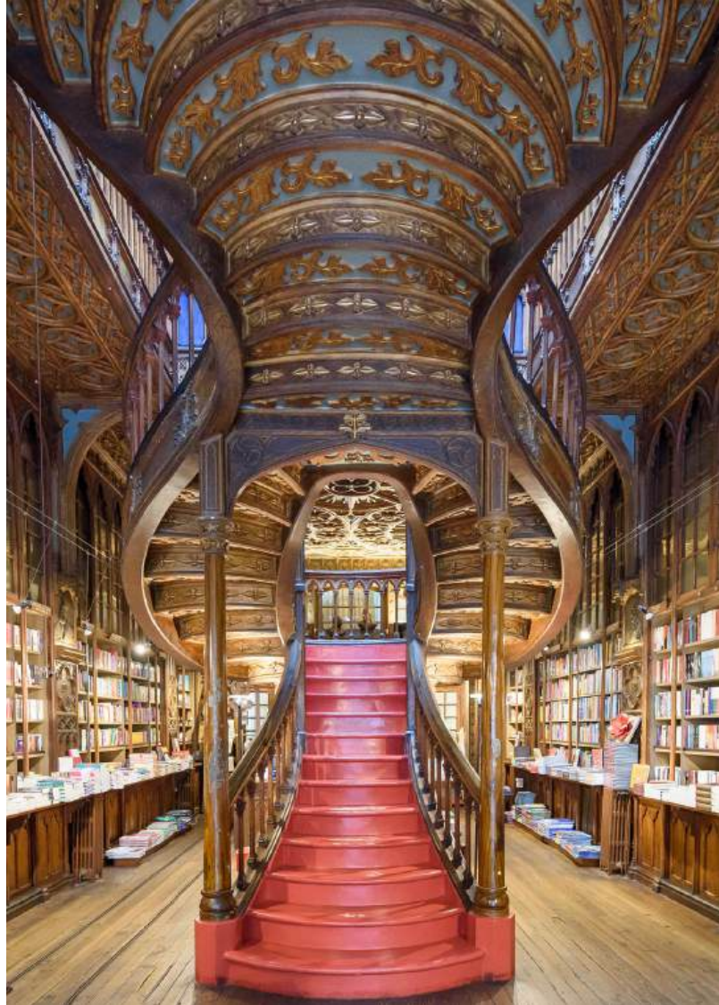
Photos clockwise from top left: Santuário de Nossa Senhora dos Remédios, Lamego; Livraria Lello, Porto; and Casa da Música, Porto, Portugal