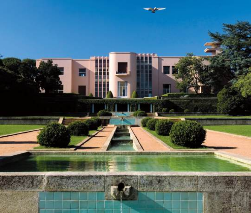
Fundação de Serralves, Porto, Portugal, © Serralves Foundation