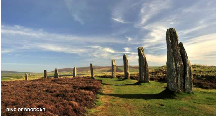
RING OF BRODGAR