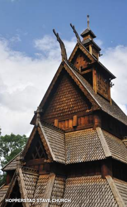
HOPPERSTAD STAVE CHURCH