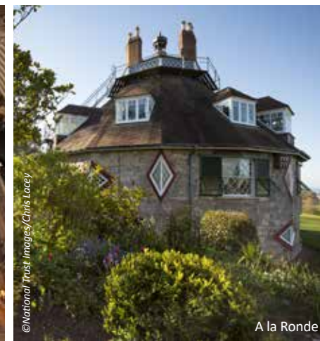
A la Ronde