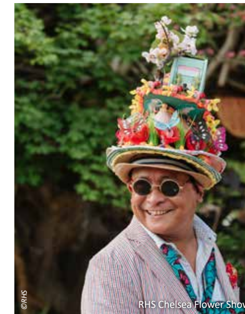
RHS Chelsea Flower Show