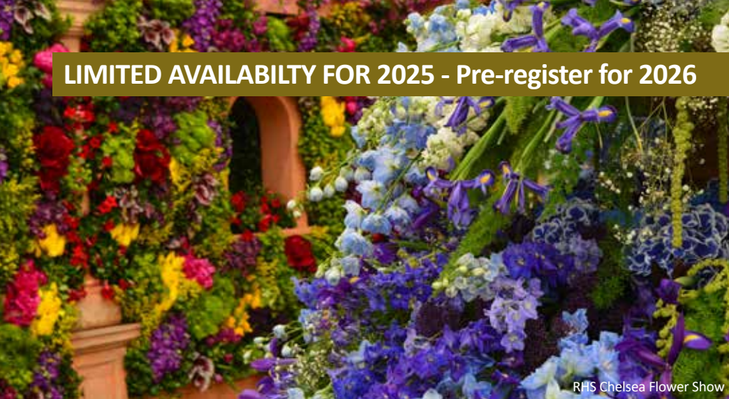
RHS Chelsea Flower Show

LIMITED AVAILABILITY FOR 2025 - Pre-register for 2026