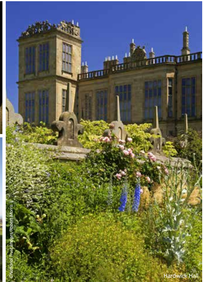
© National Trust Images/Robert Morris Hardwick Hall