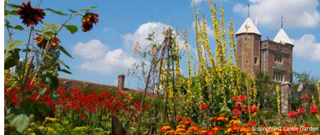
Sissinghurst Castle Garden

May 18: Sissinghurst Castle Garden & Lullingstone Castle