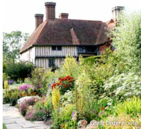
Great Dixter House

May 17: Great Dixter House & Gardens & Hole Park