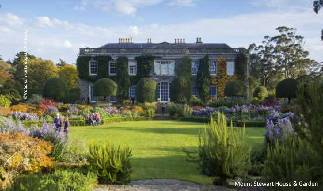
Mount Stewart House & Garden