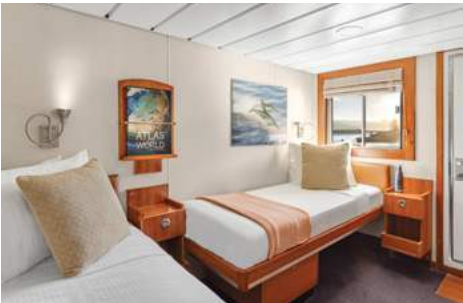
Category 2 cabin with single beds.

All cabins face outside with windows, private bathroom, and climate controls. Cabins are equipped with Wi-Fi and multiple electrical and USB outlets. Botanically inspired shampoo,