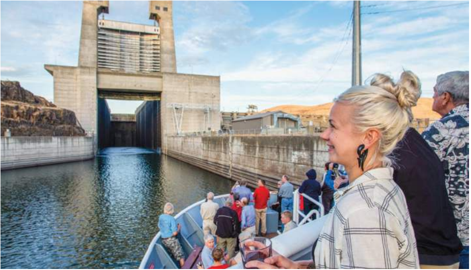
Guests take in the view as they approach Ice Harbor Lock and Dam, Lower Snake River in southeastern Washington.

in the art at local galleries, sampling sweets at the country's #1 candy store, or popping into cozy tasting rooms. (B,L,D)