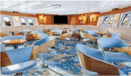
The lounge is the center of life aboard ship.

The ship features a library; global market; lounge with full-service bar and facilities for films, slide shows, and presentations; observation deck; partially covered sundeck with chairs and tables; and LEXspa. An open Bridge provides guests an opportunity to meet the officers and captain and learn about navigation.