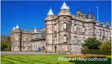
Palace of Holyroodhouse