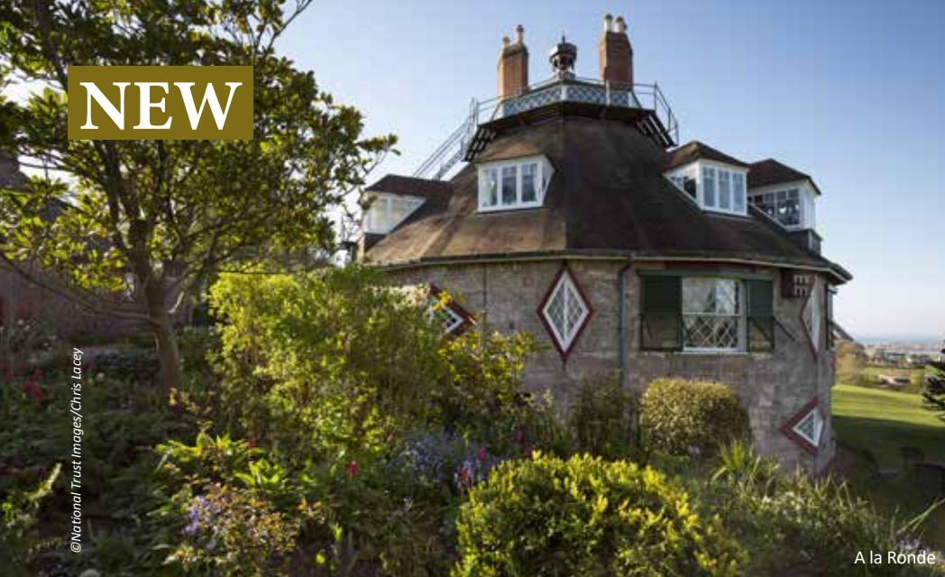
A la Ronde