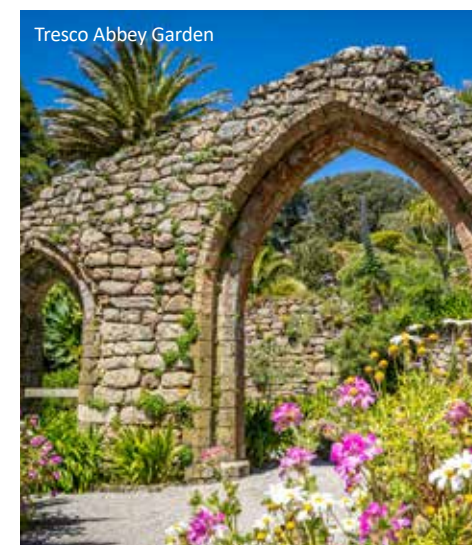
Tresco Abbey Garden

Today we see why artists have long been drawn to Cornwall. We begin with the holiday town of St Ives, home to a maze of cobbled streets and pretty cottages plus the Cornwall branch of the Tate Gallery.