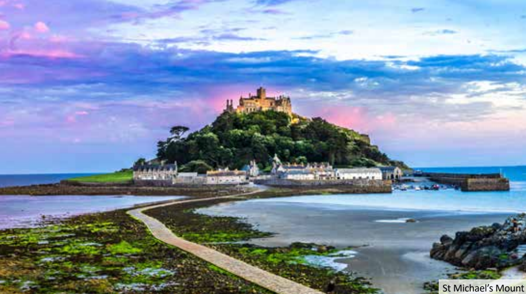
St Michael's Mount