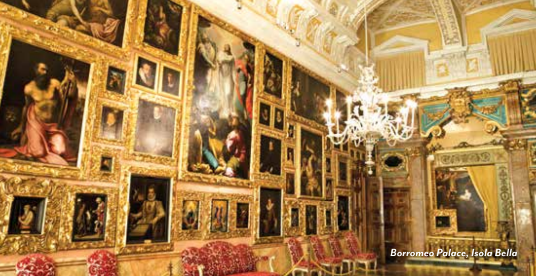
Borromeo Palace, Isola Bella