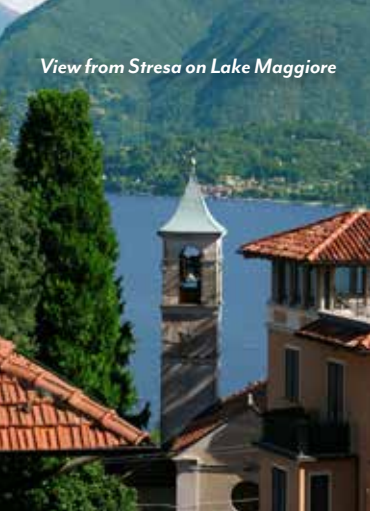
View from Stresa on Lake Maggiore