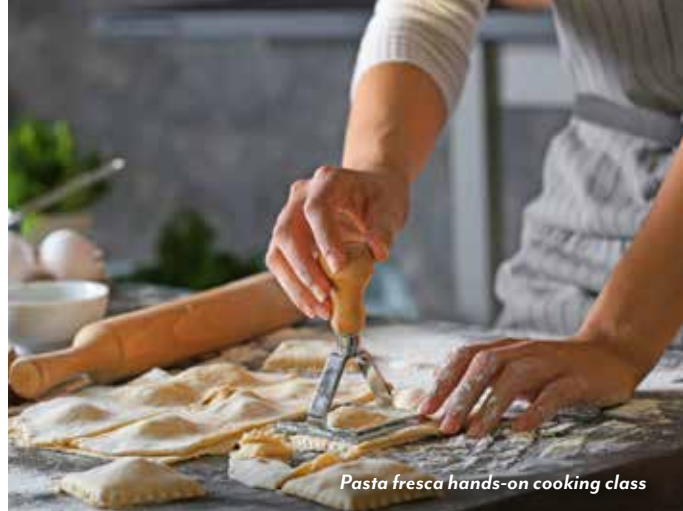
Pasta fresca hands-on cooking class

statuary, architectural details and strutting white peacocks. Reboard the boat for the return to Stresa, the setting for Hemingway's iconic novel "A Farewell to Arms." Enjoy spectacular mountain views as you explore the town and have lunch on your own. This afternoon at the hotel, hear an art lecture by a local expert, then enjoy dinner on your own. (B)