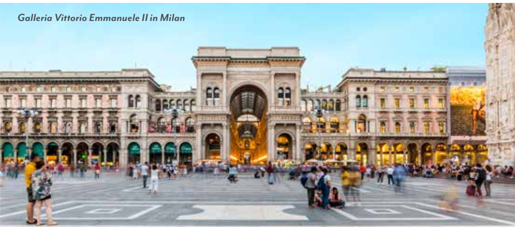
Galleria Vittorio Emmanuele II in Milan

Following breakfast, transfer to Milan Airport for your return flight home. (B)