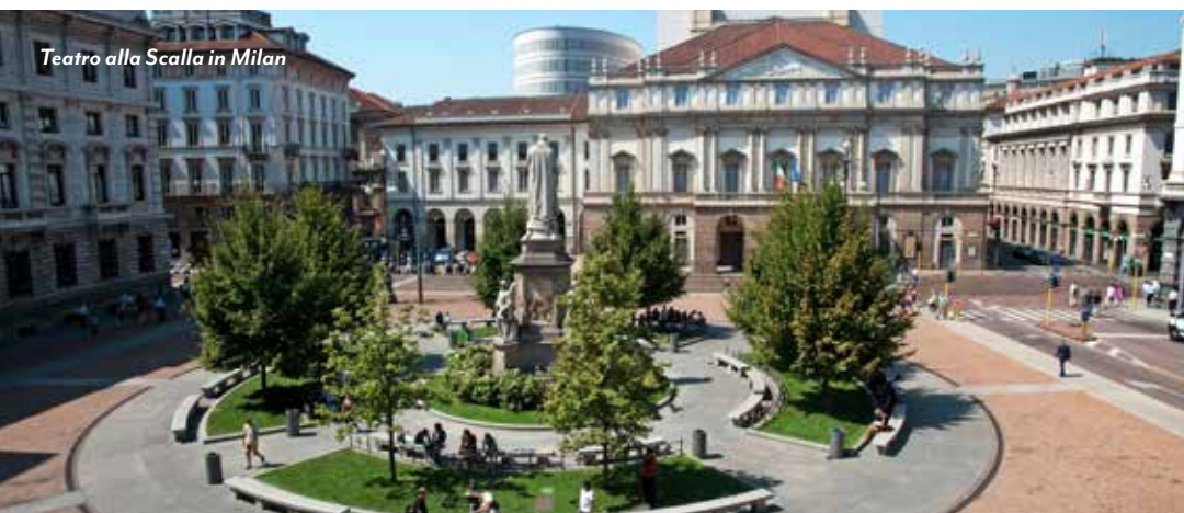
Teatro alla Scala in Milan

Enjoy a private boat cruise on Lake Maggiore, gliding past islands graced with elegant villas and striking natural beauty. Visit the crown jewel of the Borromean archipelago, Isola Bella, boasting the 17th-century Palazzo Borromeo. Explore the baroque palace with its astounding collection of art and antiques, and the summerhouse, which is home to a mosaic marine-themed grotto. Stroll the lush gardens, filled with rare flowers and plants,