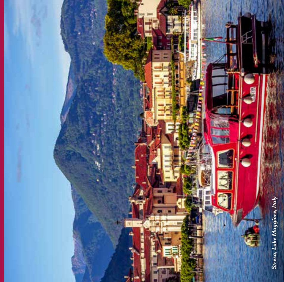
Siresa, Lake Maggiore, Italy

PRSR1 STD U.S. Postage PAID Gohagan & Company