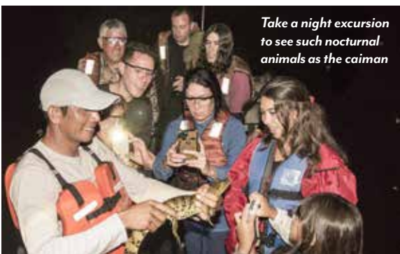
Take a night excursion to see such nocturnal animals as the caiman