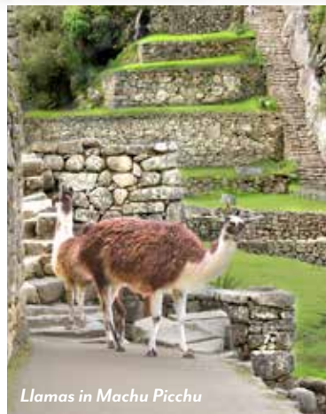
Llamas in Machu Picchu

Cradled by the soaring peaks of the Andes Mountains, the Inca citadel of Machu Picchu evokes awe and wonder like few places on Earth. Our itinerary includes an extraordinary opportunity to experience the majesty of this “Lost City of the Incas” and other treasures of the lush Sacred Valley. Built in the 15 th century as a summer retreat for the Inca Emperor Pachacutec, Machu Picchu was unknown to the outside world for four centuries until American explorer Hiram Bingham III stumbled upon it in 1911. A century of extensive research and study still has not revealed the secrets of its purpose, its residents or its abandonment; nevertheless, this UNESCO World Heritage Site has been carefully excavated and preserved. Our exploration of the Sacred Valley’s ancient engineering marvels also includes a visit to the fortress of Ollantaytambo, which stands as a lasting testimony to the powerful and far-reaching Inca Empire. Here, village craftsmen employ age-old techniques to weave intricate tapestries and sculpt colorful pottery. You will also discover the Inca stone fortress of Sacsayhuamán in the Inca capital of Cuzco and see the UNESCO-designated city’s grand Baroque- and Renaissance-style churches — a fascinating mix of pre-Columbian and colonial influences.