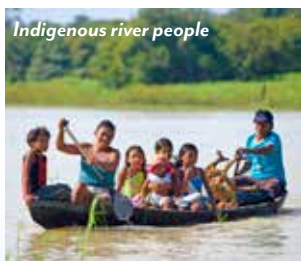
Indigenous river people

Winding over more than 4,400 miles from the Andes Mountains to the Atlantic Ocean, the Amazon River flows through nine South American countries and vast tracts of virgin rainforest producing one-fifth of the world's freshwater supply. More than one-third of all species recorded in the world are found in the Amazon River Basin, constituting the largest plant and animal species on Earth. This majestic, jungle-fringed region is also home to many indigenous river people, or riberleños , who have lived in harmony with the forest for centuries. Often referred to as the “lungs of the planet,” the Amazon River Basin is home to the world's largest tropical rainforest and plays a vital role in regulating Earth's climate and producing oxygen—despite the fact that survival of its wondrous species remains under threat from deforestation, mining and agriculture. Efforts are being made to protect this natural treasure and its inhabitants—including conservation initiatives, sustainable development projects and a drive to promote eco-tourism. However, much more needs to be done to ensure that its people, plants and animals can thrive for generations to come.