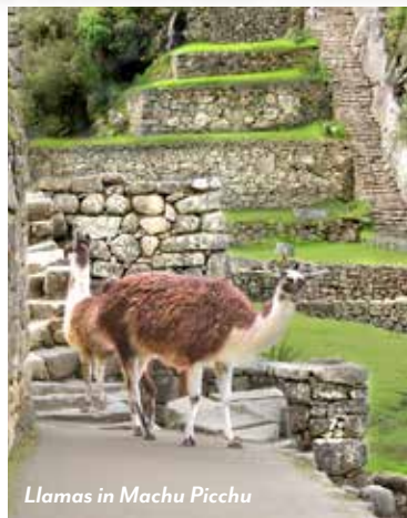
Llamas in Machu Picchu

Cradled by the soaring peaks of the Andes Mountains, the Inca citadel of Machu Picchu evokes awe and wonder like few places on Earth. Our itinerary includes an extraordinary opportunity to experience the majesty of this “Lost City of the Incas” and other treasures of the lush Sacred Valley. Built in the 15 th century as a summer retreat for the Inca Emperor Pachacutec, Machu Picchu was unknown to the outside world for four centuries until American explorer Hiram Bingham III stumbled upon it in 1911. A century of extensive research and study still has not revealed the secrets of its purpose, its residents or its abandonment; nevertheless, this UNESCO World Heritage Site has been carefully excavated and preserved. Our exploration of the Sacred Valley’s ancient engineering marvels also includes a visit to the fortress of Ollantaytambo, which stands as a lasting testimony to the powerful and far-reaching Inca Empire. Here, village craftsmen employ age-old techniques to weave intricate tapestries and sculpt colorful pottery. You will also discover the Inca stone fortress of Sacsayhuamán in the Inca capital of Cuzco and see the UNESCO-designated city’s grand Baroque- and Renaissance-style churches — a fascinating mix of pre-Columbian and colonial influences.