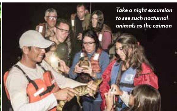
Take a night excursion to see such nocturnal animals as the caiman