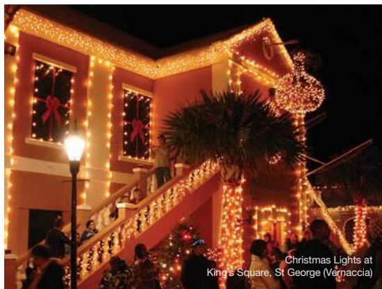
Christmas Lights at King's Square, St George

Enjoy a private cocktail cruise to St. George and take in the festive celebrations of the Bermuda National Trust's Christmas Walkabout.