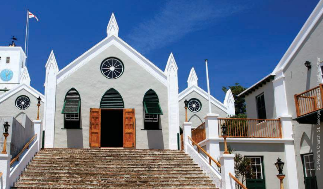
St. Peter's Church, St. George, Bermuda. Traveling-Officer