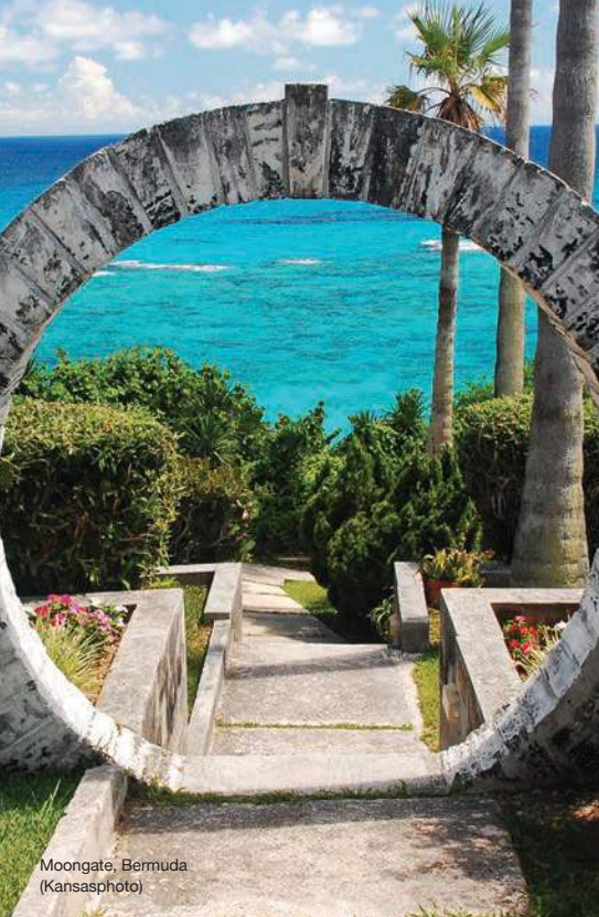
Moongate, Bermuda