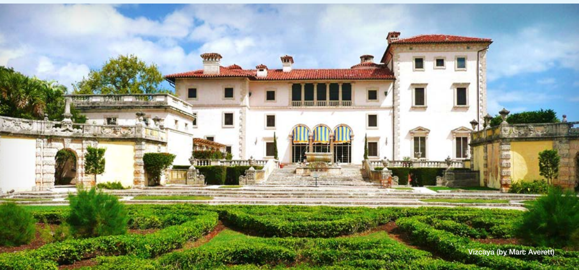
Vizcaya (by Marc Averett)

Breakfast is included, with independent transfers to local airports for flights home. (B)