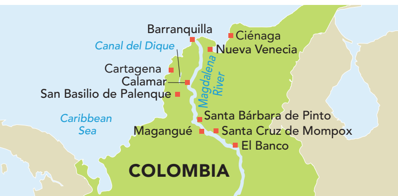
Catedral de Santa Catalina de Alejandría, Cartagena (top); Map of the region (above)