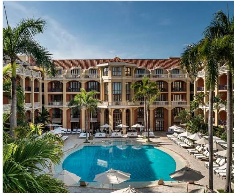
Sofitel Legend Santa Clara Cartagena

A former 17th-century convent, this fully renovated property exudes luxury and elegance while retaining its historic elegance and early architectural details. Rest in comfortable, air-conditioned rooms with extra-large beds. The Jardín restaurant offers sustainable cuisine with fresh ingredients and El Caastro is a sophisticated outdoor space. It also has a spa for treatments, a pool with a bar, a business center, a fitness center, and more.