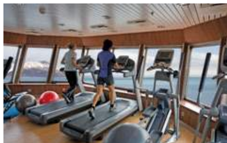
Fitness center with panoramic views.

Every staff member is committed to ensuring guests have an unforgettable experience. Many of the veteran guides and naturalists are locally based and have worked with the company for decades. A full-time medical professional, undersea specialist, National Geographic photographer and certified photo instructor are on board, and with a low staff-to-guest ratio, you can hear different perspectives and gain new insights every day.