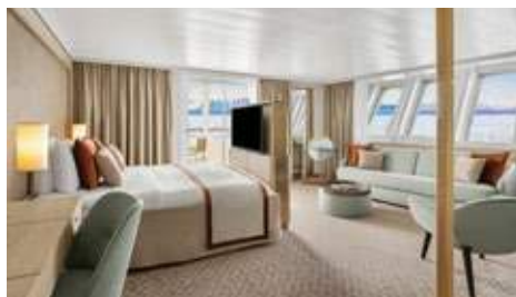
Newly renovated Category 7 suite with balcony.

All cabins and suites face outside with windows or portholes, and have a private bathroom and climate controls. Equipped with Wi-Fi, multiple electrical outlets, USB outlets, full-length mirror