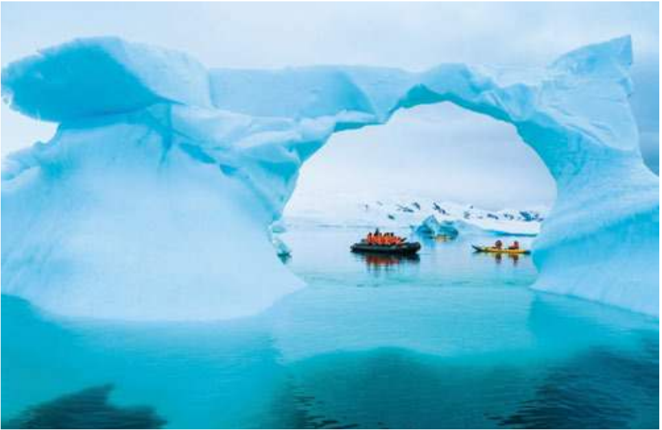
Guests exploring by Zodiac in Antarctica.

cruise amid porpoising penguins. While wildlife is magnificent, ice defines the Antarctic. You'll get to know ice up close and personal—from icebergs the size of islands, bergy bits and near-vertical glaciers, to the fragile, nearly invisible layers that have just begun to freeze. One day, you might set out by kayak to encounter towering icebergs at water level; embark on a Zodiac excursion in search of seals and blue-eyed shags; or walk amid thousands of Adélie and gentoo penguins. The next, you might experience the thrill of the ship crunching through pack ice. In Antarctica, opportunities abound to capture uniquely beautiful images. Along the way your expert expedition team will enrich every experience. (B,L,D)