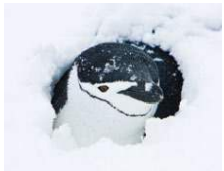
A chinstrap penguin burrowed in the snow.

This morning, the ship will be moored off of King George Island once again. Following disembarkation and Zodiac rides to shore, the flight departs the White Continent and returns to Puerto Natales for an overnight stay. (B,L,D)