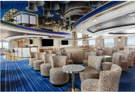
The lounge is the perfect place to relax.

All cabins and suites feature ocean views, private facilities, climate controls and a flat-screen TV.