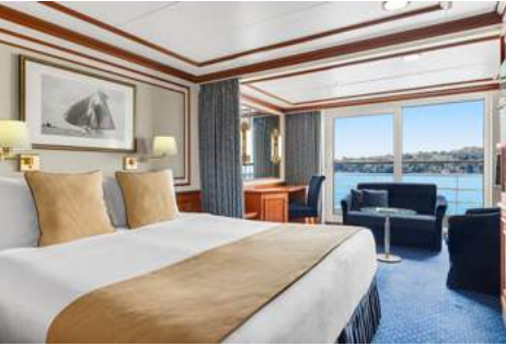
Category 6 cabin.

Equipped with Ethernet and Wi-Fi connections and USB ports for mobile devices. Some cabins have French balconies. Botanically inspired shampoo, conditioner, shower gel and lotion are all available in cabin bathrooms, as well as an Expedition Essential Kit. Hair dyes and complimentary insulated bottles are available in each cabin.