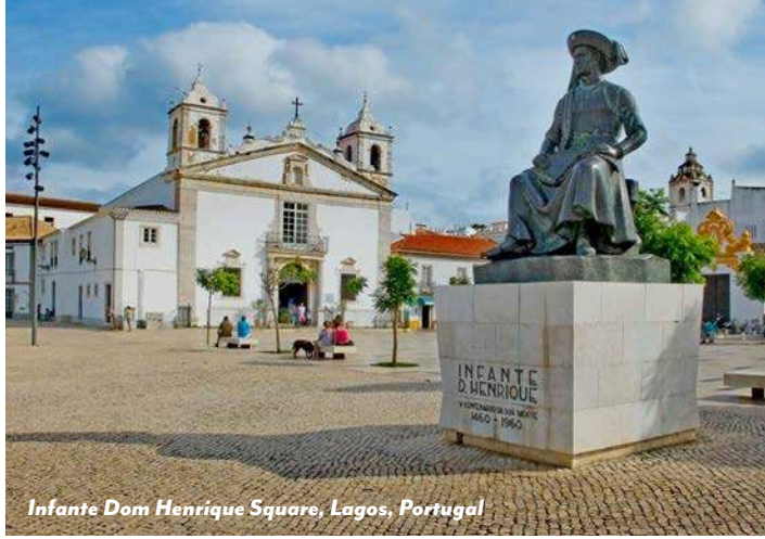
Infante Dom Henrique Square, Lagos, Portugal