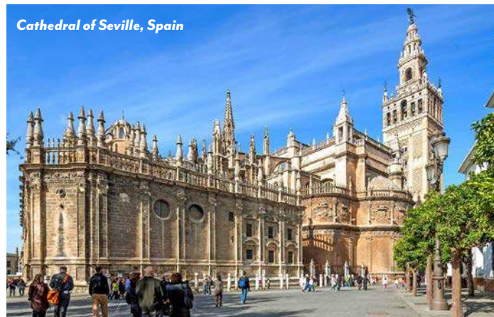
Cathedral of Seville, Spain

Savor local cuisine over lunch. Leisure time offers opportunity