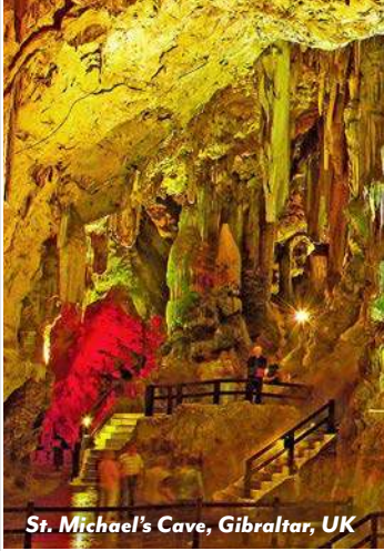
St. Michael's Cave, Gibraltar, UK