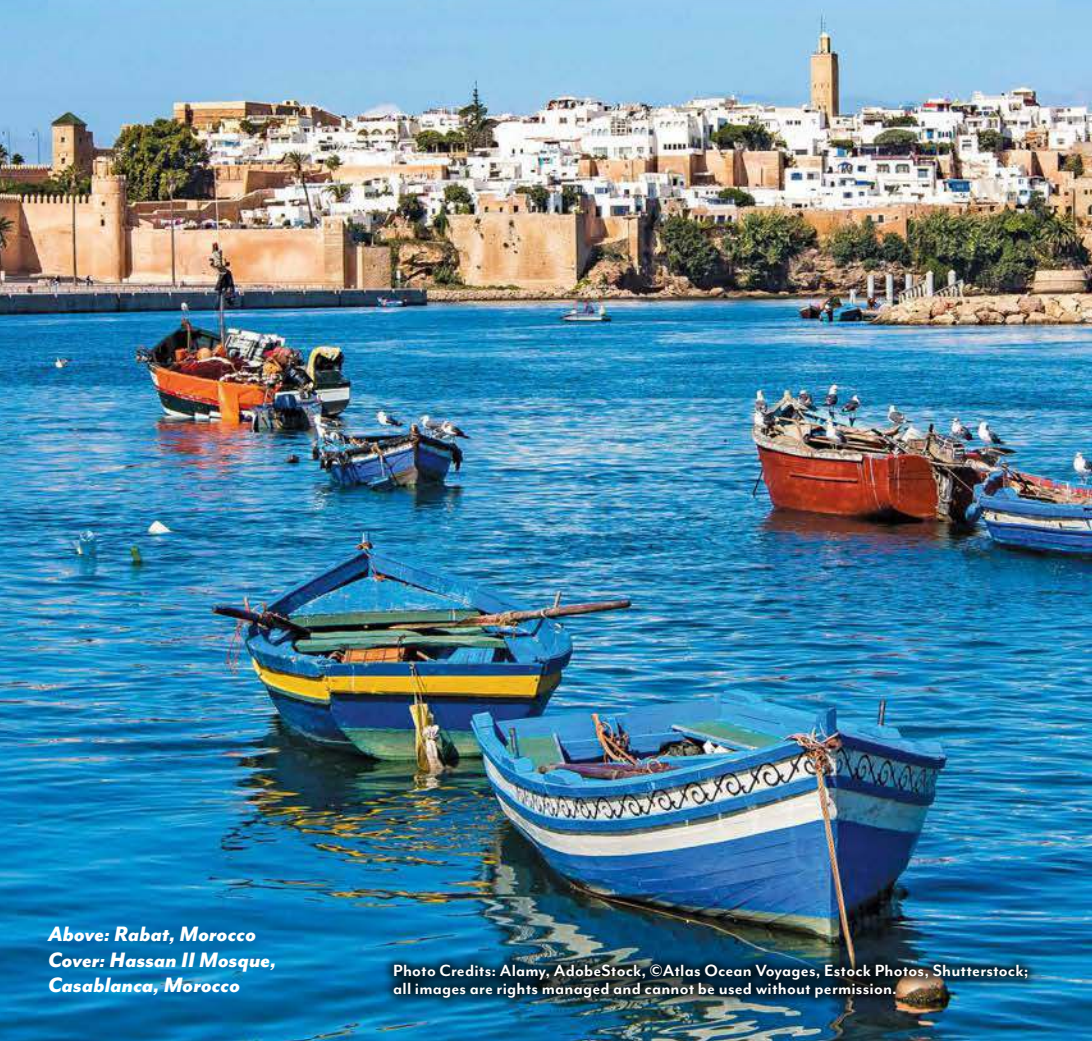
Above: Rabat, Morocco Cover: Hassan II Mosque, Casablanca, Morocco

Photo Credits: Alamy, AdobeStock, ©Atlas Ocean Voyages, Estock Photos, Shutterstock; all images are rights managed and cannot be used without permission.