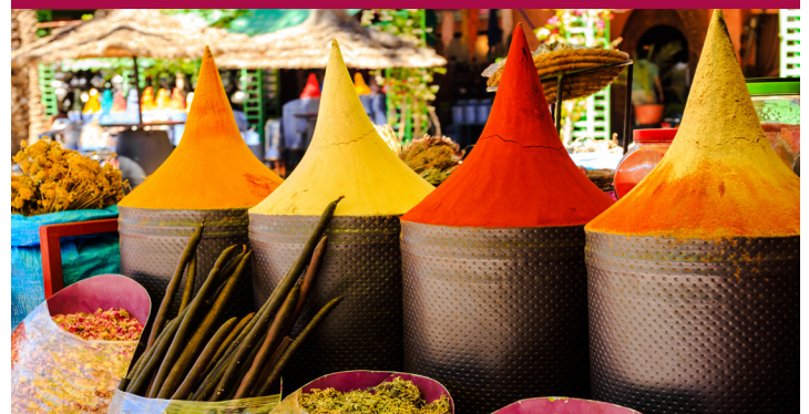
Marrakech | 4 days, 3 nights Koutoubia Mosque | Bahia Palace | Souk Tour