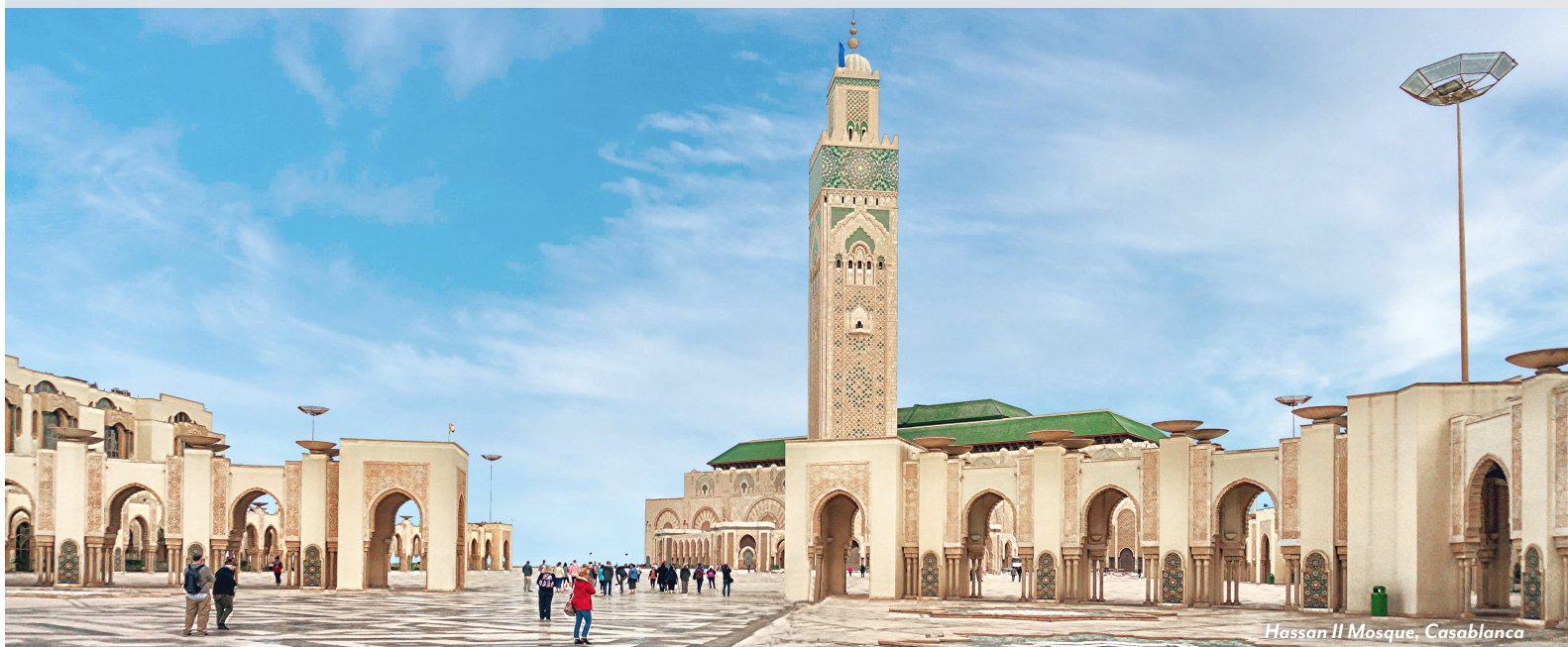
Hassan II Mosque, Casablanca