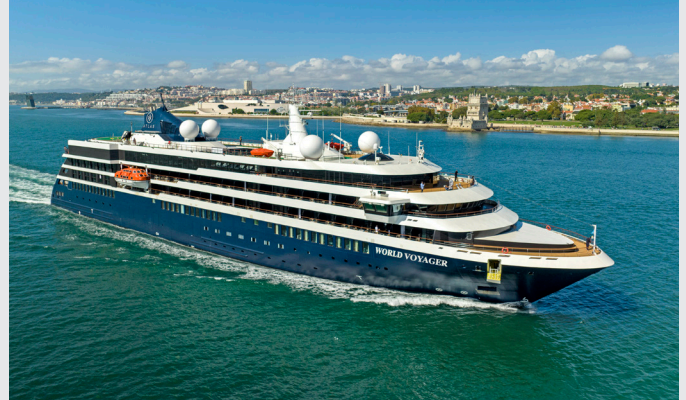
World Voyager Exclusively Chartered, Small Ship