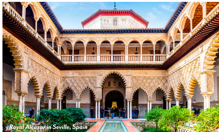
Royal Alcázar in Seville, Spain