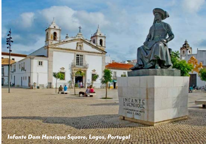
Infante Dom Henrique Square, Lagos, Portugal