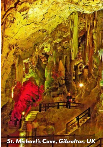
St. Michael's Cave, Gibraltar, UK