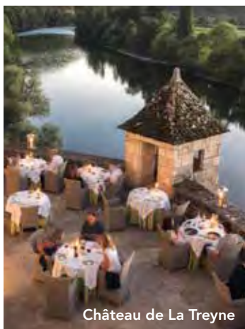
Château de La Treyne