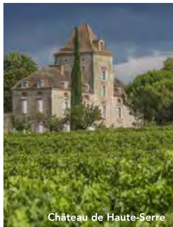
Château de Haute-Serre

Activity Level: Activities are generally not very strenuous, however, we expect that guests can enjoy two hours or more of walking each day, are sure-footed on cobbled and unpaved surfaces, and can walk up and down stairs without assistance. Château de Mercuès was constructed in the 13th century. Guests will find stone floors and stairways that may not have railings. The property has an elevator, but it does not access every floor.