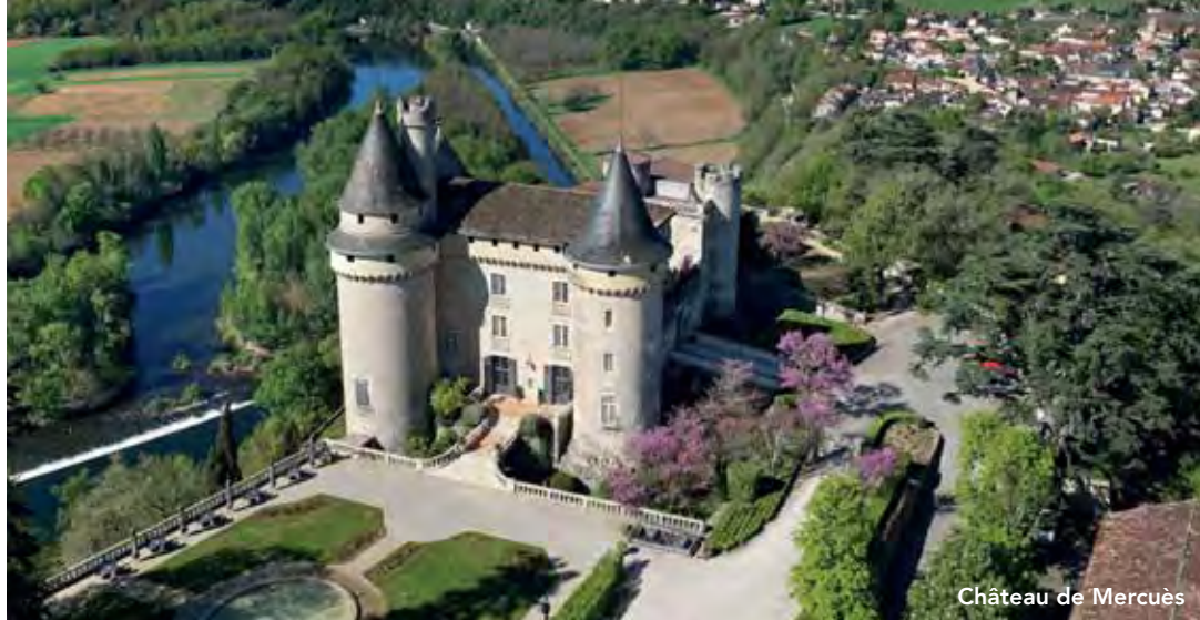
Château de Mercuès