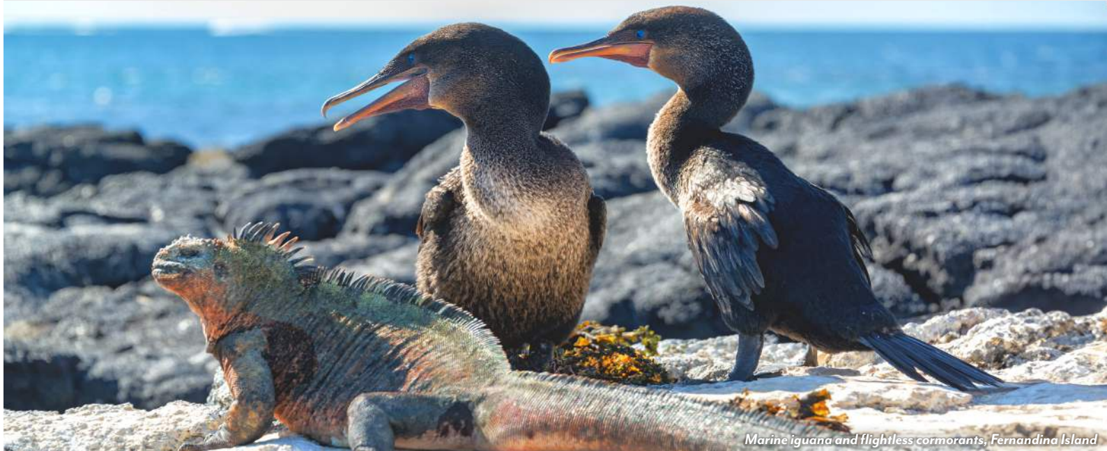
Marine iguana and flightless cormorants, Fernandina Island