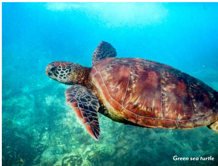
Green sea turtle

Exclusively Chartered, First-Class Small Ship