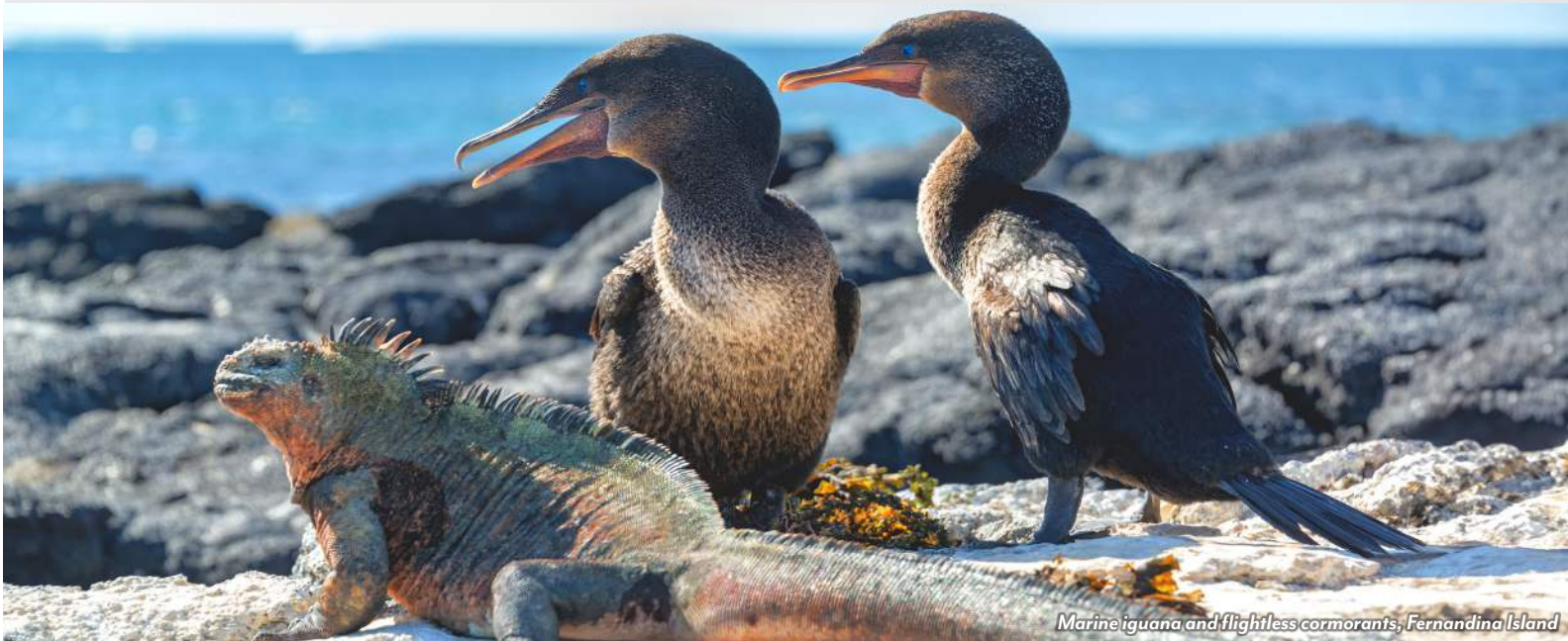
Marine iguana and flightless cormorants, Fernandina Island