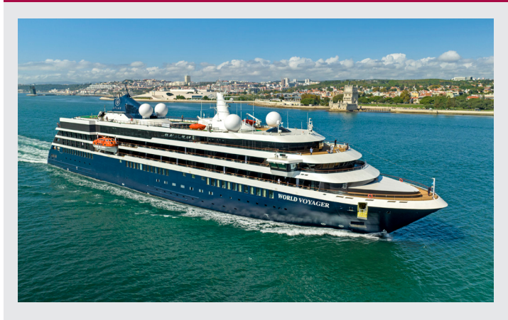
World Voyager Exclusively Chartered, Small Ship