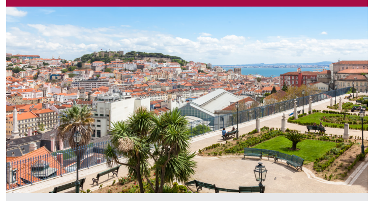
Lisbon | 3 days, 2 nights City Tour | Bairro Alto | Chiado