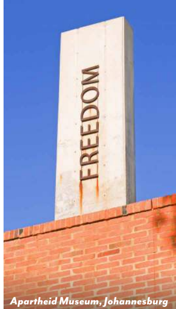
Apartheid Museum, Johannesburg

a different perspective as the animals venture to the Chobe River, to cool off during the afternoon heat. Expert local guides will lead game-viewing river safaris aboard small excursion boats through this unspoiled ecosystem.