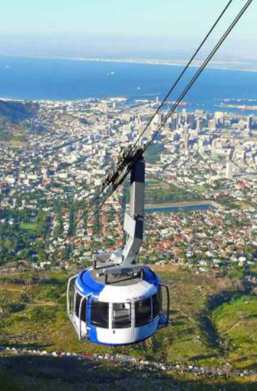
Table Mountain cable car