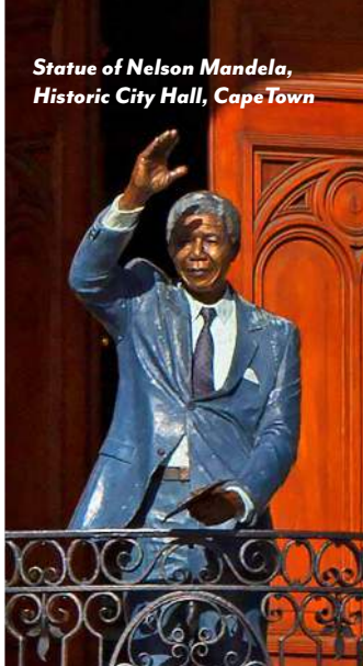
Statue of Nelson Mandela, Historic City Hall, Cape Town