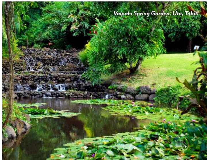
Vaipahi Spring Garden, Uta, Tahiti

All Program Features are contingent upon final brochure pricing. 2026