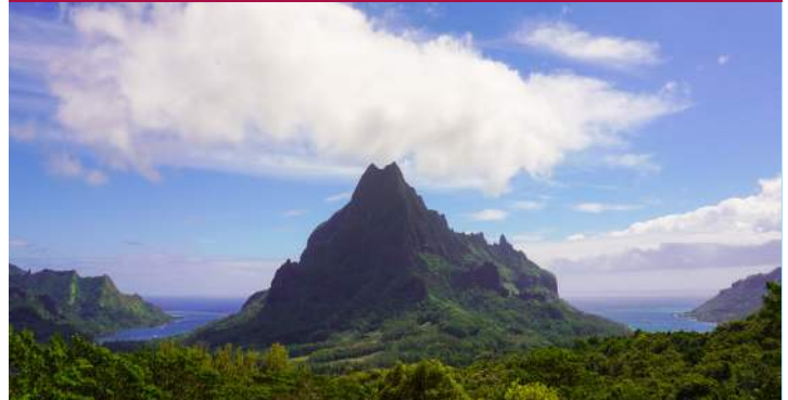
Mo'orea | 4 days, 3 nights March 12 to 15, 2026 | Program Ends: March 15