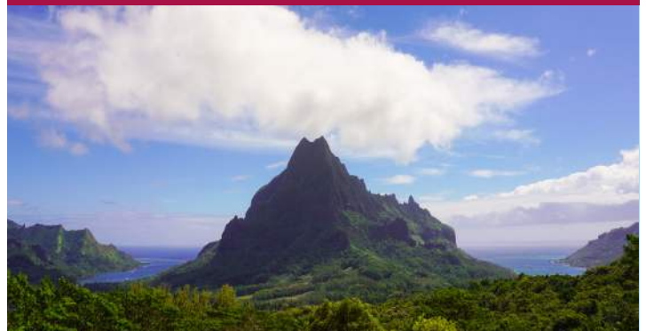
Mo'orea | 4 days, 3 nights March 12 to 15, 2026 | Program Ends: March 15