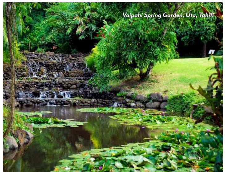
Vaipahi Spring Garden, Uta, Tahiti

All Program Features are contingent upon final brochure pricing. 2026