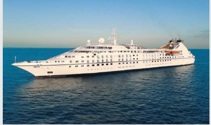
Star Breeze Deluxe Small Ship (Group Space)