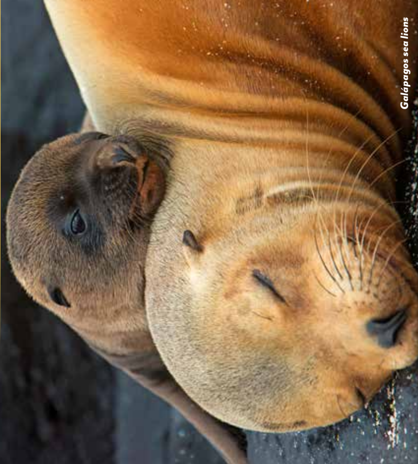
Galápagos sea lions

PRSRT STD U.S. Postage PAID Gohagan & Company