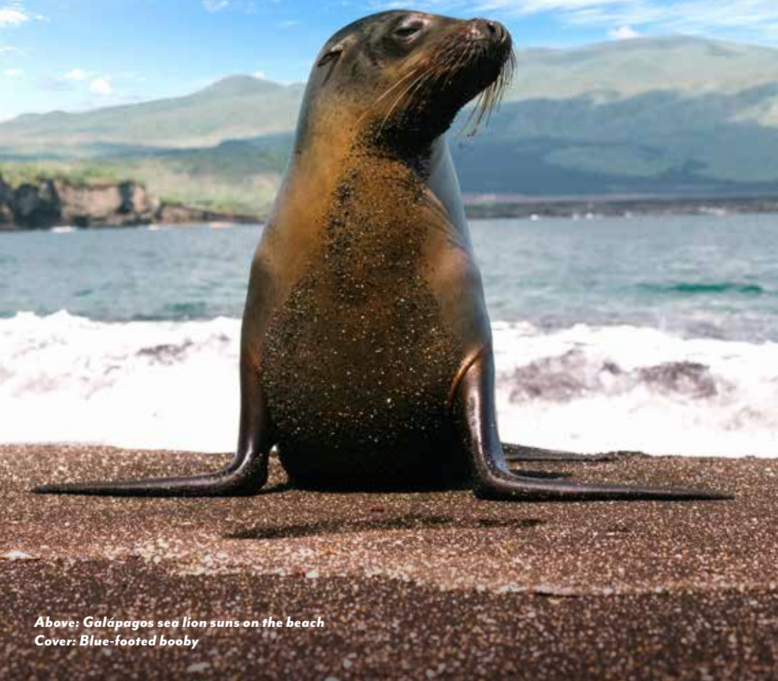
Above: Galápagos sea lion suns on the beach