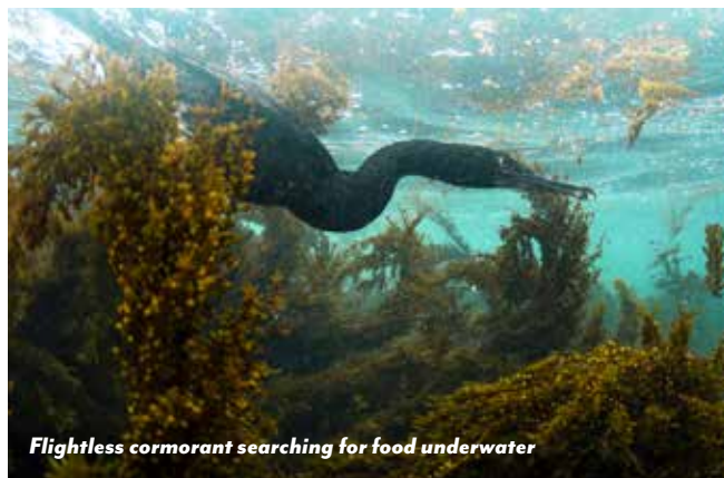
Flightless cormorant searching for food underwater