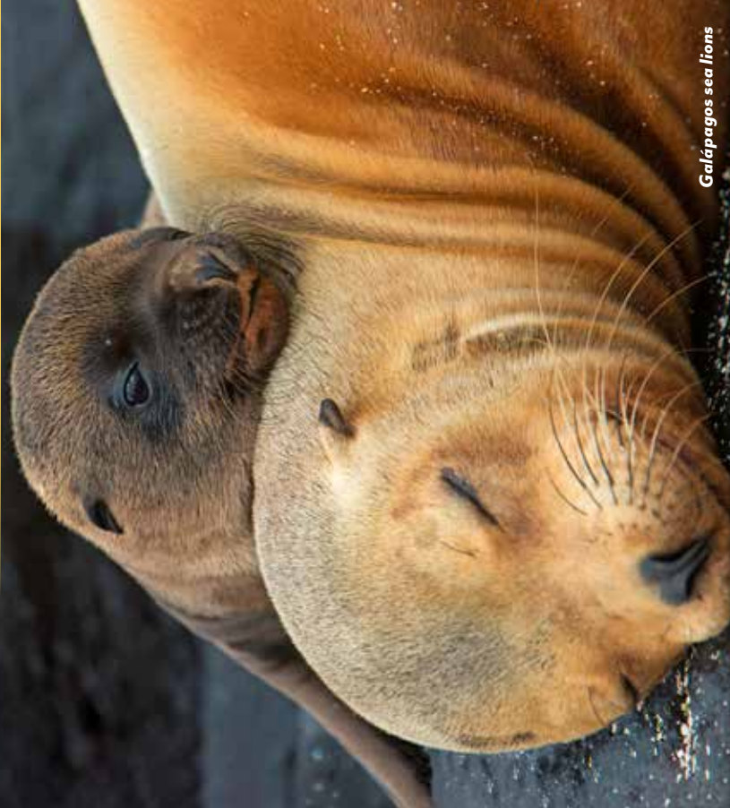
Galápagos sea lions

PRSRT STD U.S. Postage PAID Gohagan & Company