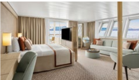
Newly renovated Category 7 suite with balcony.

All cabins and suites face outside with windows or portholes, and have a private bathroom and climate controls. Equipped with Wi-Fi, multiple electrical outlets, USB outlets, full-length mirror