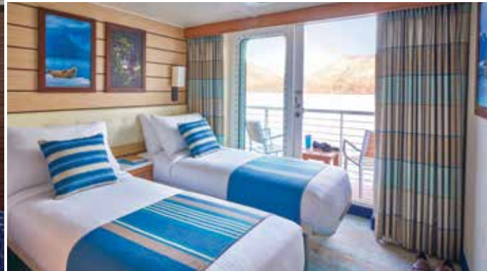
Clockwise above: the lounge, with 270° views, is the hub of the expedition community; Category 5 cabin is our most spacious; Category 4 cabin with single beds (which can be converted to queen) and private step-out balcony.

CATEGORY 1: Main Deck #301-306 Cabins face outside with two portholes, feature two single beds that can convert to a queen, a writing desk, two nightstands, full length mirror and a closet.