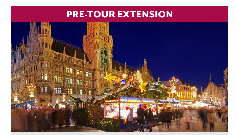
Munich | 4 days, 3 nights Romantic Road | City Tour | Holiday Markets