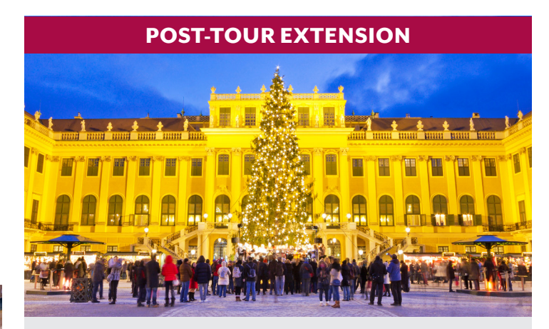
Vienna | 3 days, 2 nights Hofburg Palace | Belvedere Palace | Holiday Markets