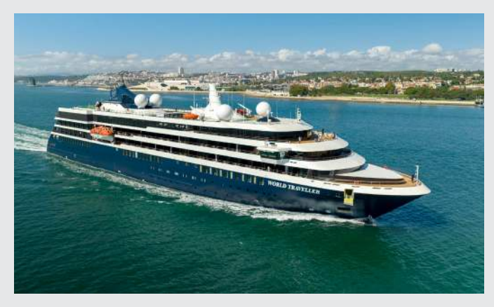
World Traveller Exclusively Chartered, Deluxe Small Ship