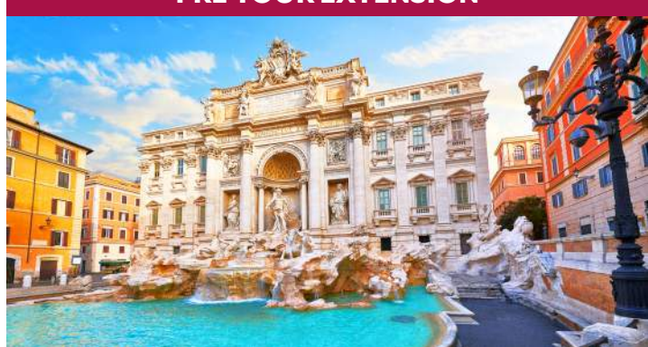
Rome | 4 days, 3 nights May 16 to 19, 2026 | Program Begins: May 17