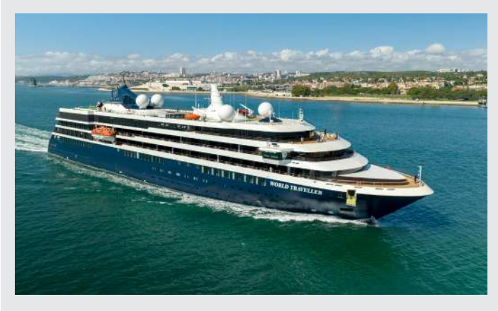
World Traveller Exclusively Chartered, Deluxe Small Ship