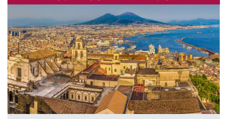
Naples | 3 days, 2 nights City Tour | Archaeological Museum | Neapolitan Pizza

All Program Features are contingent upon final brochure pricing. 2026-2