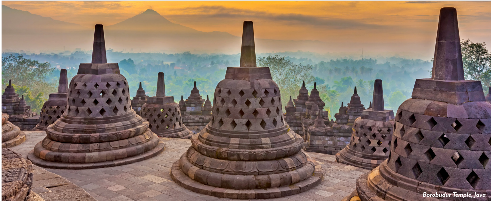
Borobudur Temple, Java