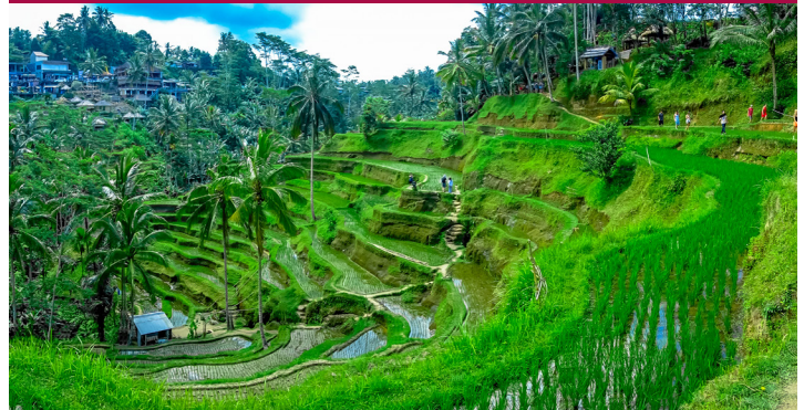
Bali | 4 days, 3 nights October 9 to 12, 2026 | Program Ends: October 11