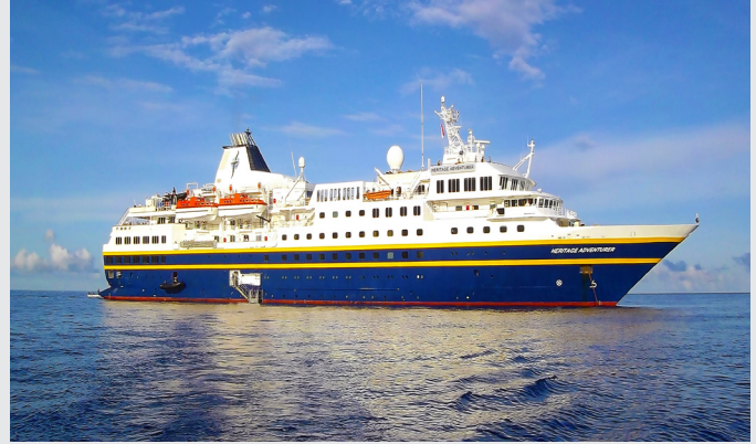
Heritage Adventurer Exclusively Chartered, First-Class Expedition Ship