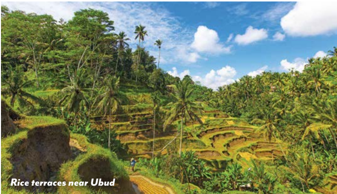
Rice terraces near Ubud