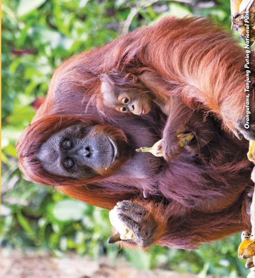
Orangutans, Tanjung Puting National Park

SPECIAL SAVINGS* AVAILABLE SAVE $2,000 PER COUPLE!