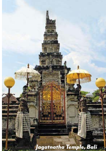
Jagatnatha Temple, Bali

Museum, one of the island's primary repositories of Balinese art, culture and history. Visit Jagatnatha Temple, the largest Hindu temple in the city and a spiritually significant symbol of Bali's deep-rooted Hindu traditions. Stop at Tohpati village to observe traditional Balinese hand weaving and batik making, tour galleries and purchase textile crafts, if you choose. Continue to Batubulan Village, a cultural and artistic hub renowned for its traditional performing arts and stone carving. Delight to a performance of a traditional Balinese Barong dance, depicting the eternal battle between good and evil.