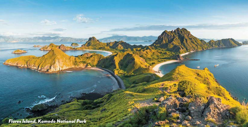
Flores Island, Komodo National Park

Park. Aboard a Zodiac boat, float through the tropical rainforest in search of these fascinating primates for a truly thrilling and memorable experience.