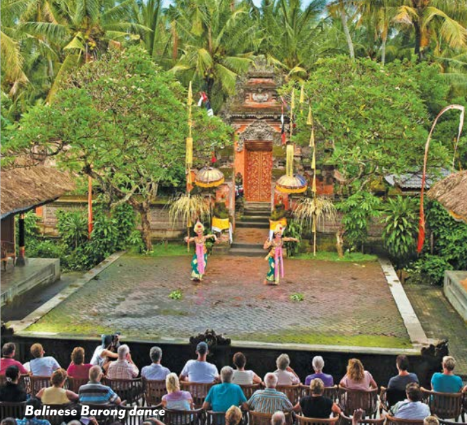
Balinese Barong dance

landscapes, diverse marine life and its most famous residents, the Komodo dragons. These formidable reptiles are Earth's largest lizards — up to 10 feet in length and weighing up to 300 pounds — and the top predators in their ecosystem. The park is home to other wildlife, including wild boars, water buffaloes, macaques and diverse bird and marine life populations. Enjoy a Captain's Farewell Reception and Dinner this evening.