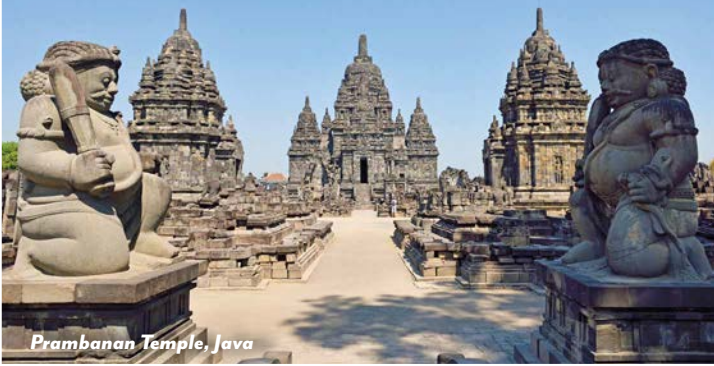
Prambanan Temple, Java