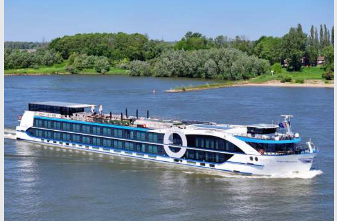
Porto Mirante Exclusively Chartered, Deluxe River Boat