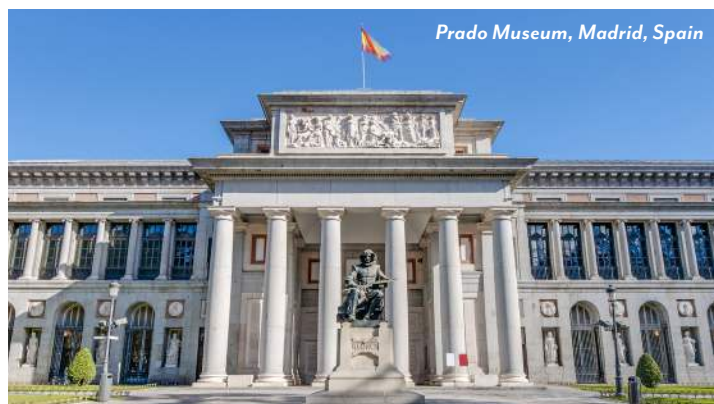
Prado Museum, Madrid, Spain