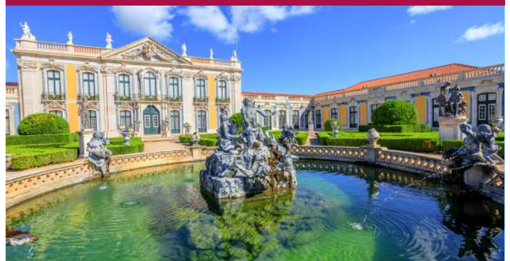
Lisbon | 3 days, 2 nights City Tour | Coimbra Visit