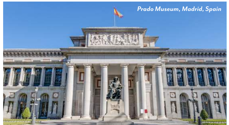
Prado Museum, Madrid, Spain