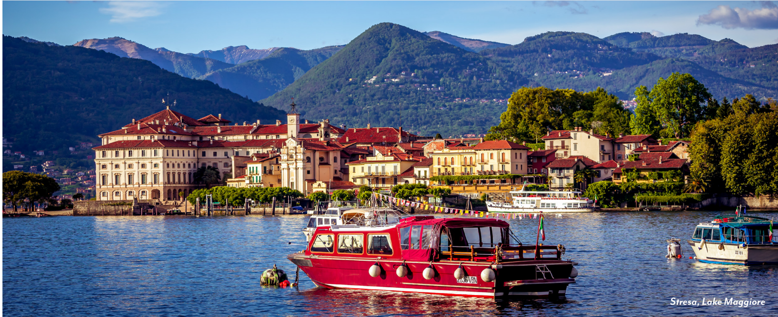
Stresa, Lake Maggiore