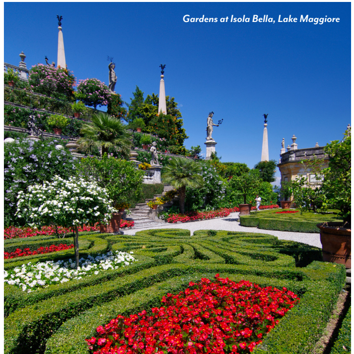
Gardens at Isola Bella, Lake Maggiore

Ideally located in the heart of Como, the belle époque Palace Hotel graces the lungolago, the lakefront promenade. The city's marble Duomo and the pedestrian-friendly town center are just steps away from your front door. Begin each day with a sumptuous breakfast buffet featuring a variety of hot and cold dishes, rounded out with freshly baked breads and pastries. After a day of exploring, gather with your traveling companions at the Garden Bar for aperitivo, Italy's evening tradition of cocktails and delicious snacks. The menu at Ristorante Antica Darsena, the hotel restaurant, features Italian and international cuisine prepared with the freshest seasonal produce. When the day draws to a close, sleep well in your tastefully decorated and well-appointed guest room.