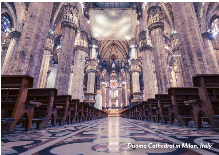
Duomo Cathedral in Milan, Italy