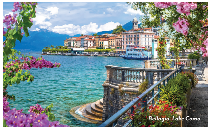
Bellagio, Lake Como