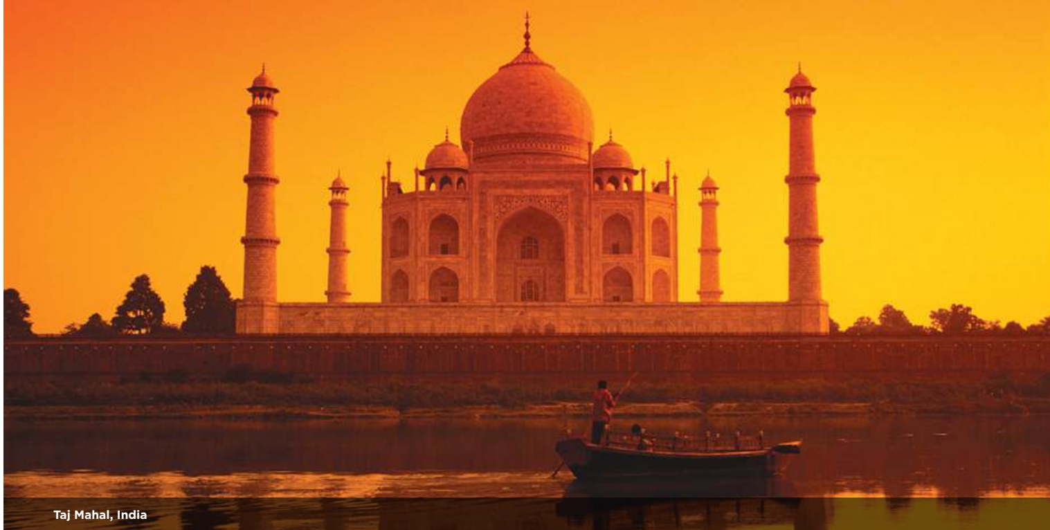
Taj Mahal, India