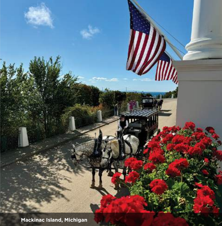
Mackinac Island, Michigan