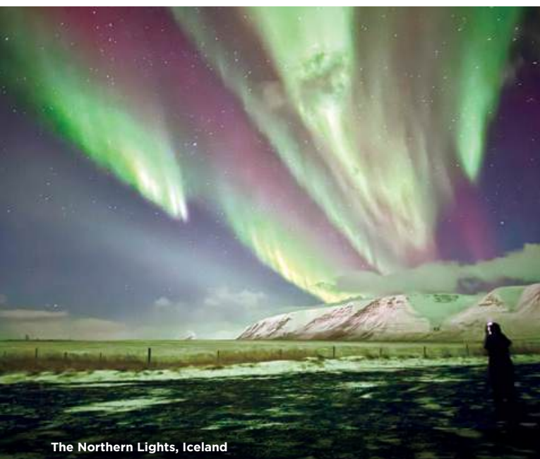
The Northern Lights, Iceland

AIR (FROM NEW YORK OR BOSTON)/LAND RATE: from $6,692