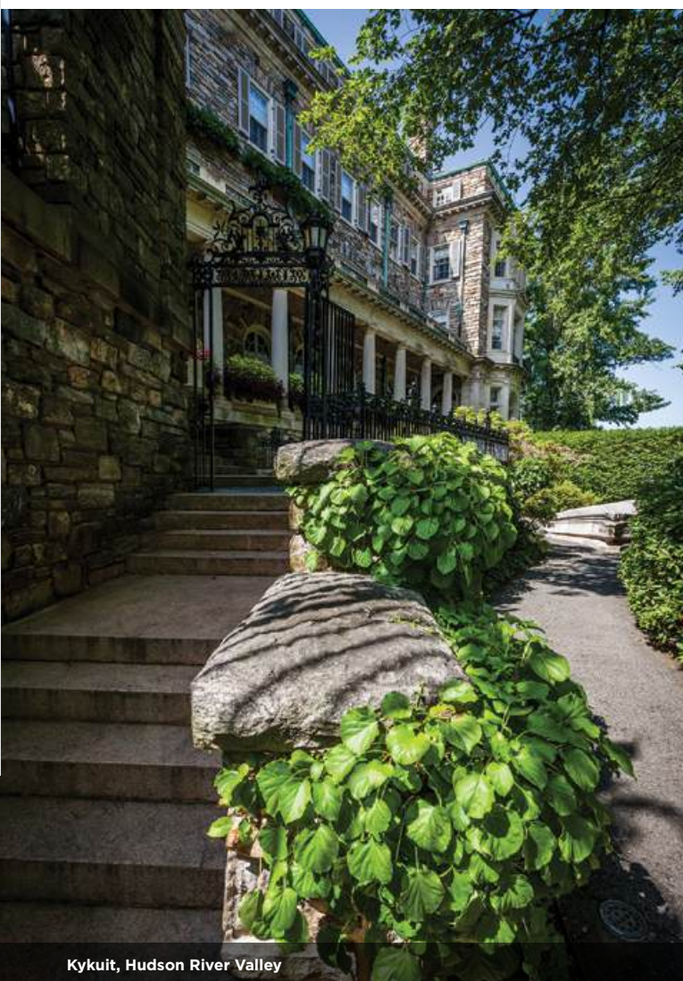
Kykuit, Hudson River Valley