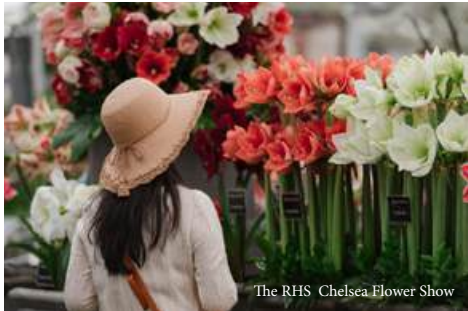
The RHS Chelsea Flower Show