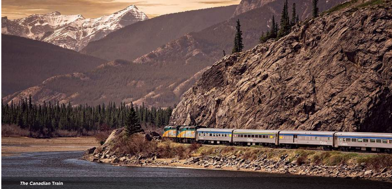
The Canadian Train