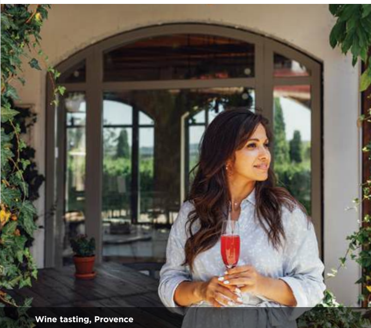
Wine tasting, Provence