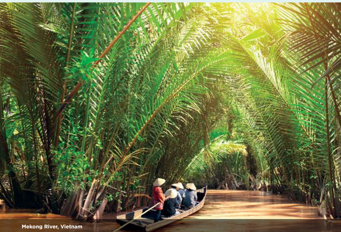
Mekong River, Vietnam