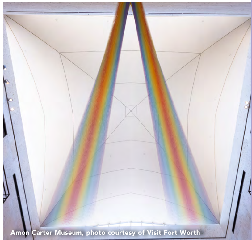
Amon Carter Museum

Drive to Fort Worth for a private docent-led tour through the Louis Kahn-designed Kimbell Art Museum . Admire the museum's renowned Asian- and European-focused collection, including works by Caravaggio, Rubens, Cézanne, and Velázquez. The museum also made global headlines for acquiring Michelangelo's first known painting, The Torment of Saint Anthony , believed to have been painted when the artist was 12 or 13 years old.