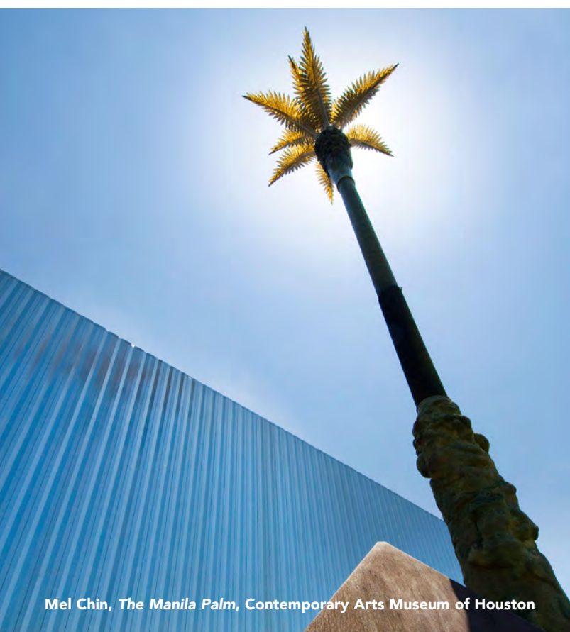
Mel Chin, The Manila Palm , Contemporary Arts Museum of Houston

Witness regional, national, and international artwork from the last 40 years and ponder its impact on modern-day life during a curator-led tour of the Contemporary Arts Museum of Houston . For 75 years, the museum has led the way in groundbreaking diverse presentations, such as Dále Gas —the first-ever exhibition of Chicano art. Take part in an in-depth discussion with Jennifer Dasal.