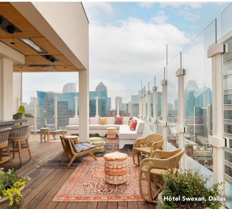
Hôtel Swexan, Dallas

This luxurious Houston hideaway welcomes you with Texas hospitality elevated to a new level. The rooftop pool, fitness center, and full-service spa create a peaceful retreat, while the restaurant prepares local Texas specialties.