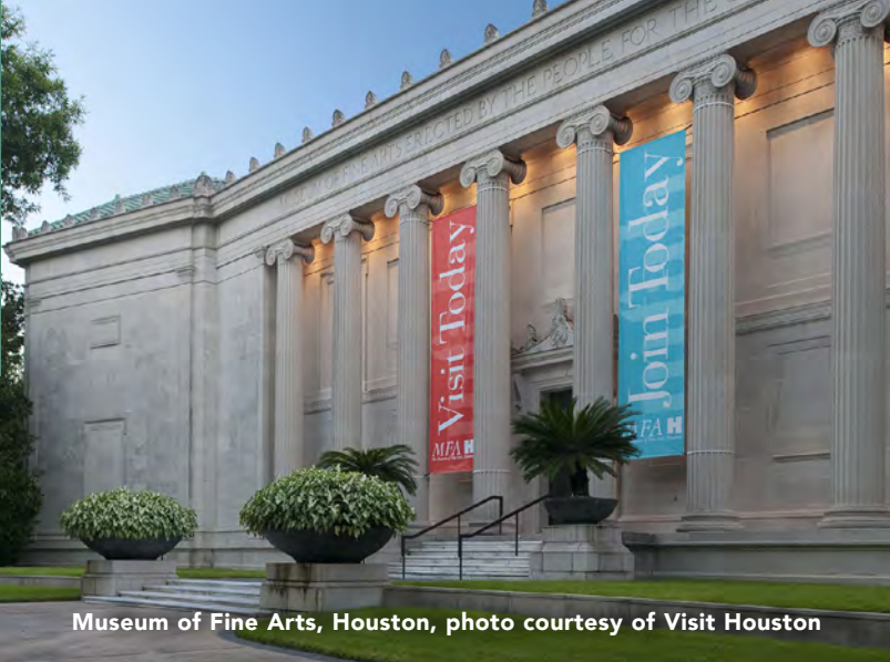
Museum of Fine Arts, Houston