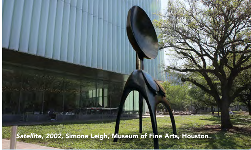
Satellite, 2002, Simone Leigh, Museum of Fine Arts, Houston

NOT INCLUDED IN RATE: Airfare; meals not specified; alcoholic beverages other than what is noted in inclusions; personal items and expenses; airport transfers; excess baggage; trip insurance; any other items not specifically mentioned as included.